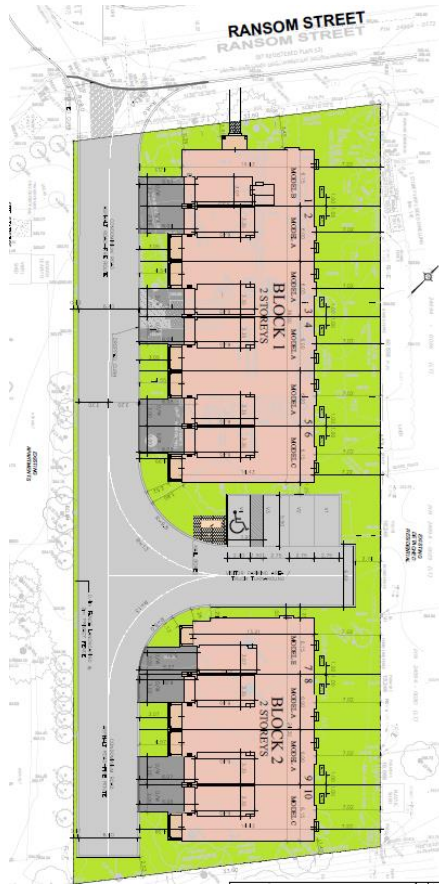
Figure 1: Concept Plan

Further details regarding the proposal are outlined in the table below.