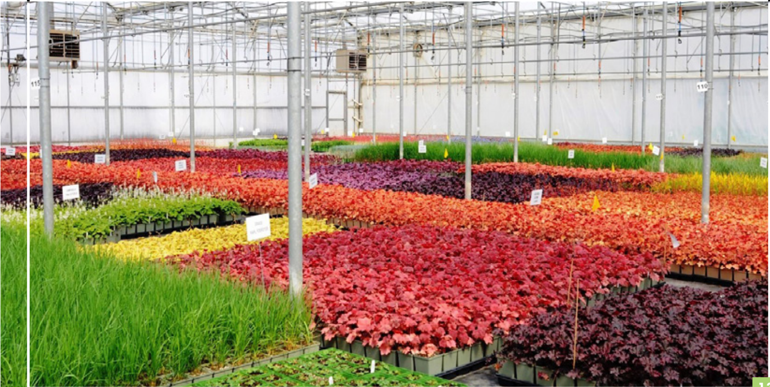
Greenhouse at Sheridan Nurseries’ Norval Farm

will facilitate the development and enhancement of policies, programs and collaborative partnerships and effective marketing of local business achievements and opportunities. Use of such a definition is also important for a municipality to be able to accurately monitor, evaluate and report on its municipal Green Economy initiatives. Since Halton Hills is inextricably linked with the Greater Toronto Area economy, it should consider adopting a regional approach to defining the Green Economy in order to provide consistent policy direction, monitoring, evaluation and marketing.