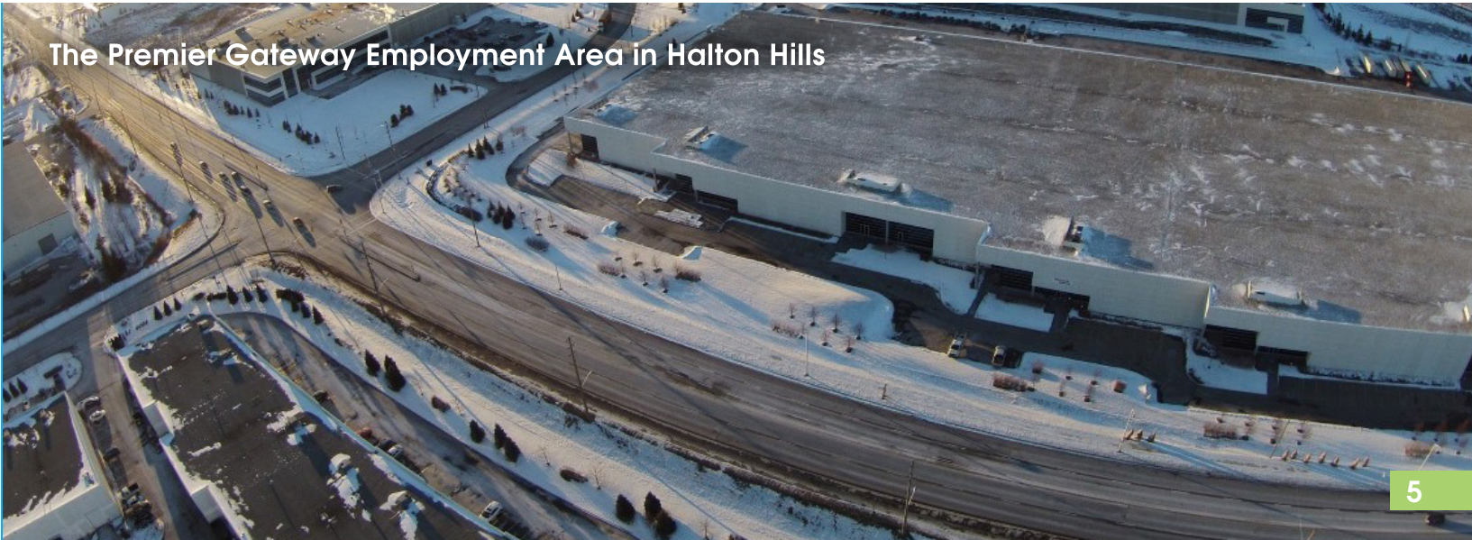
The Premier Gateway Employment Area in Halton Hills

The Town’s Economic Development, Innovation and Culture division provides a full suite of high-quality supports. The division is focused on business retention and expansion (BR&E); elevating Halton Hills’ competitiveness in the global marketplace; delivering a comprehensive Business Concierge program; site selection assistance; market research; industry engagement; implementation of the Community Improvement Plan and the Manufacturing Expansion Fund; amplifying tourism’s economic benefits; and leveraging the arts and culture to raise quality of life.