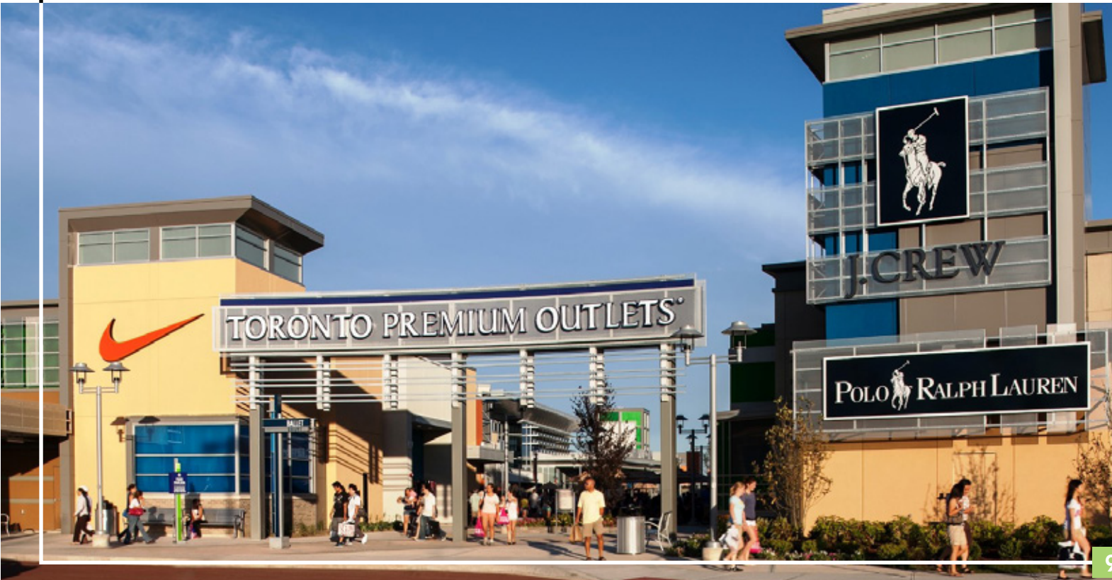
Toronto Premium Outlets located in Halton Hills’ Premier Gateway Employment Area

Land and Building Supply Without an adequate supply of land and/or buildings, businesses cannot grow or locate in Halton Hills. The current