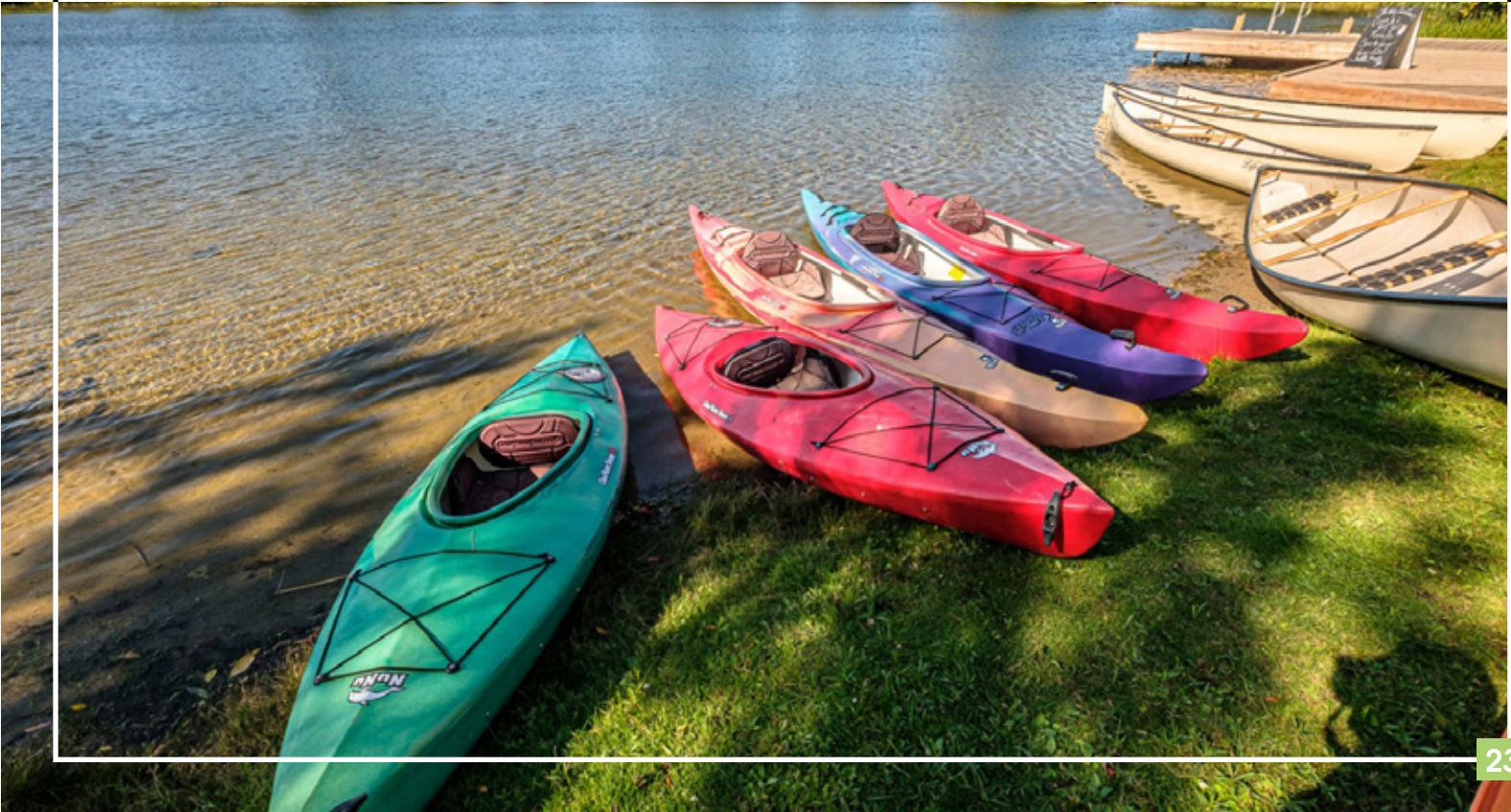
Fairy Lake in Acton, adjacent to Prospect Park

Each Sub-Strategy has value propositions which will form the basis for messaging to convey the unique aspects that differentiate Halton Hills from its neighbours and illustrate why Halton Hills is the ideal place to invest, build a business, visit, play and live.