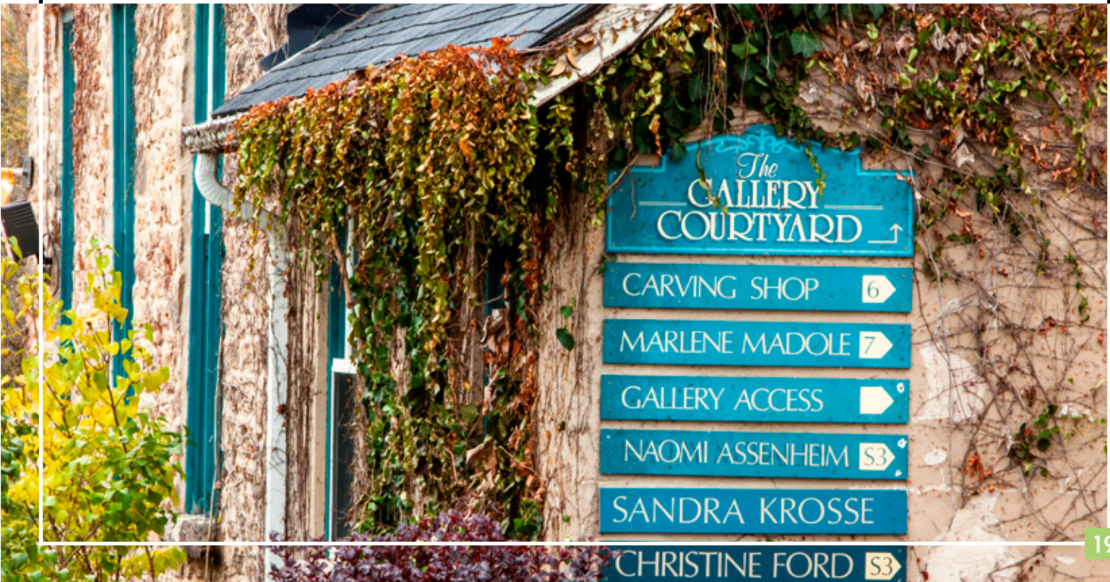
Williams Mill Creative Arts Studios in the hamlet of Glen Williams