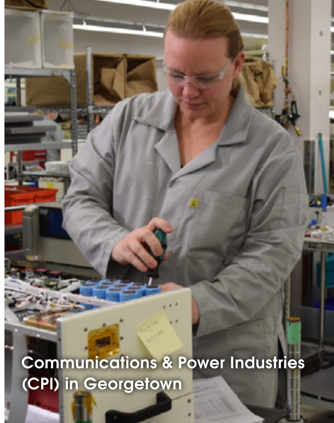
Communications & Power Industries (CPI) in Georgetown

The Town's Economic Development and Tourism Strategy: