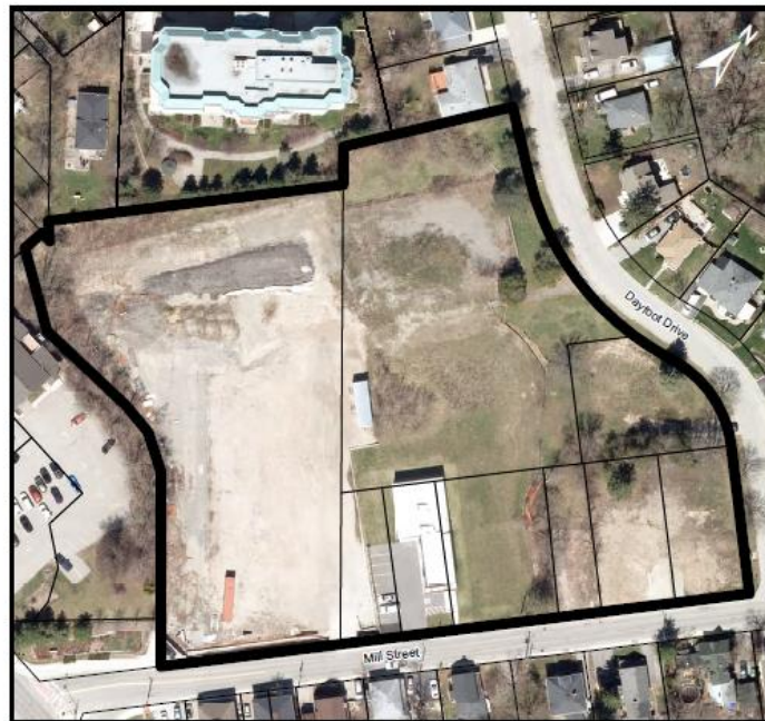
Figure 1 – Amico Consolidated Site

The irregularly shaped consolidated parcel has an area of approximately 1.9 hectares (4.7ac.), frontage of approximately 164.0 metres (538.0 ft.) on Mill Street and 154.2 metres (506.0 ft.) of flanking frontage on Dayfoot Drive.