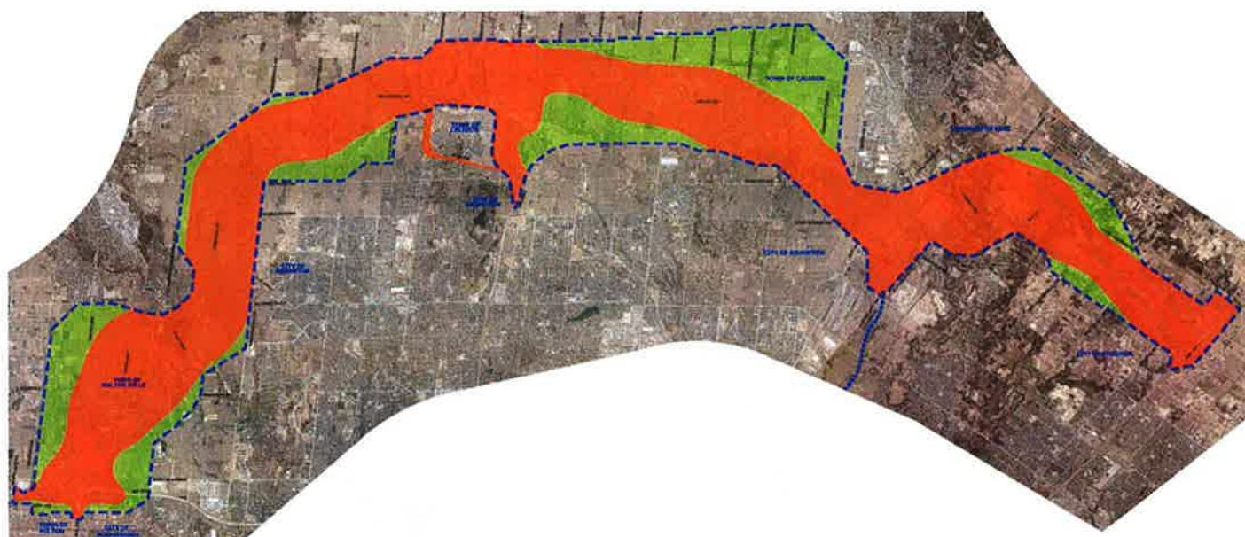
Figure 1 – GTA West Environmental Assessment Study Area