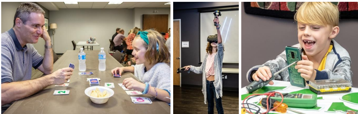
Photos: Library Programming: Boardgame Night, Virtual Reality, Repair Cafe

The Halton Hills Public Library enriches the community with extensive cultural programming throughout the year, often in coordination with community partners. Highlights of 2018 successes include: