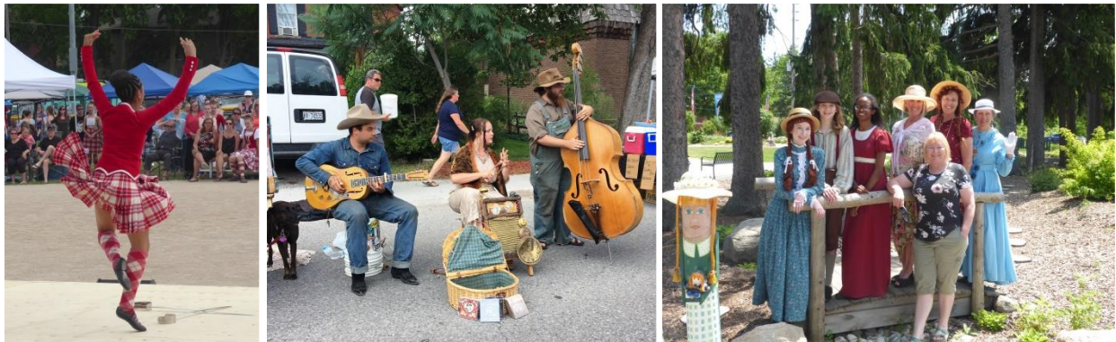
Photos: Highland Games, Leathertown Festival, Anne of Green Gables Day

The following are highlights of community-led initiatives that are contributing to the Cultural Vibrancy of Halton Hills: