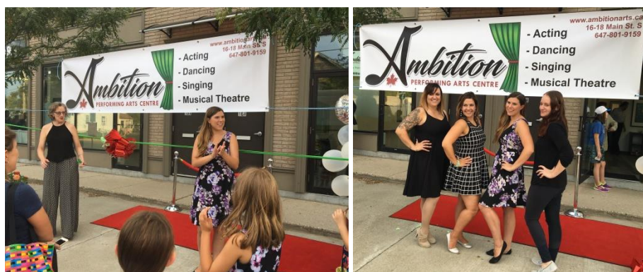
Photos: Grand Opening of Ambition Performing Arts Centre

Ambition, a new multi-discipline performing arts facility had its grand opening in Acton in August, 2018. Ambition offers classes in dance, singing, music, and theatre, as well as stage and screen acting for all ability levels and ages 3 to 18.