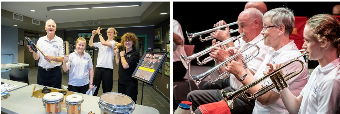
Photos: On Beat in the Hills! Instrument Petting Zoo and Performance

The band is currently preparing for a few of this year's performances, including a Spring Concert, Classic and Iconic Car, Toy Drive 2019, 7 th Annual 'With Glowing Hearts – A Musical Tribute to the Armed Forces'. Later on this year, rehearsals will prepare for the annual Remembrance Day Services, Georgetown and Milton Santa Claus Parades as well as the annual Christmas Concert at Market Place Mall.