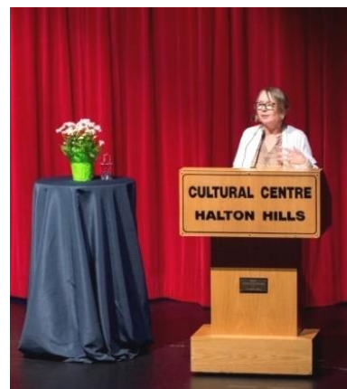
Photo: Shari Lapena at the John Elliott Theatre.