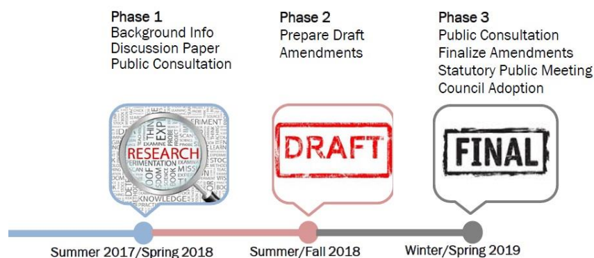
Figure 1: Rural Review Work Program

The Rural Policy and Zoning Review is being undertaken to identify the changes that need to be made to the Town’s Official Plan, with regards to the Natural Heritage System, Agricultural System and mineral aggregate resources, in order to bring it into conformity with the Regional Official Plan (ROPA 38). The Study is comprised of three phases (see Figure 1). The geographic areas of the Town affected by the Study are shown on Figure 2.