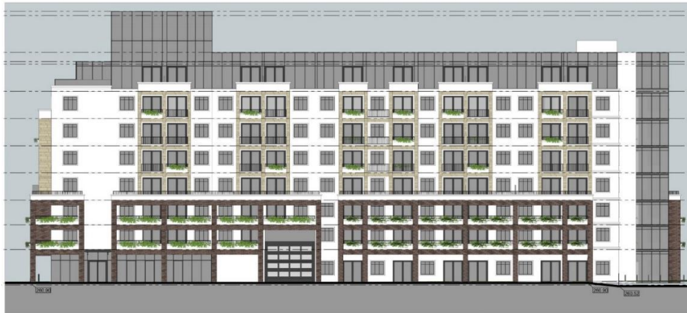
BUILDING - 3 _ WEST ELEVATION _ SCALE 1:200