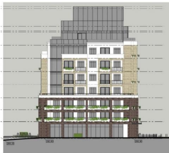
BUILDING - 3 _ NORTH ELEVATION _ SCALE 1:200