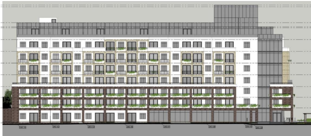
BUILDING - 3 _ EAST ELEVATION _ SCALE 1:200