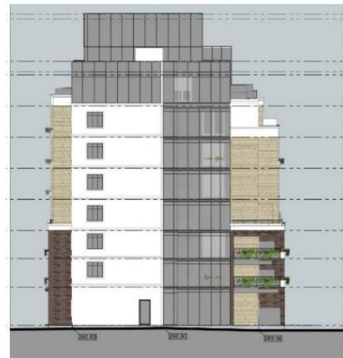
BUILDING - 3 _ SOUTH ELEVATION _ SCALE 1:200

Note: A surrounding feature that each building elevation faces is noted in brackets above each elevation for additional context within the site and the surrounding neighbourhood.