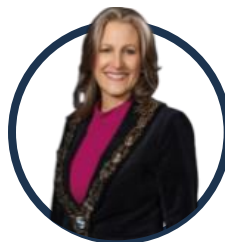
Mayor Marianne Meed Ward City of Burlington @mariannemeedward.bsky.social 147 Followers