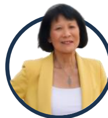
Mayor Olivia Chow City of Toronto @mayoroliviachow.ca 658 Followers