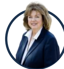
Mayor Carolyn Parrish City of Mississauga @carolynparrish.bsky.social 53 Followers