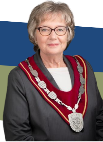
Mayor Ann Lawlor @annlawlor.bsky.social