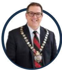
Mayor Cam Guthrie City of Guelph @camguthrie.bsky.social 204 Followers