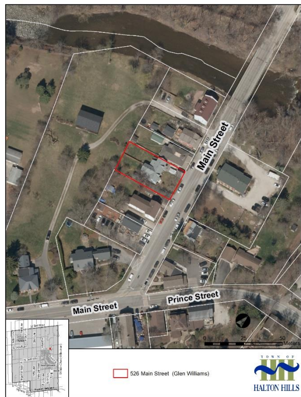
Figure 2: Aerial Photograph - 526 Main Street

This research and evaluation report describes the history, context, and physical characteristics of the property at 526 Main Street in Glen Williams, Halton Hills, Ontario (Figure 1 and Figure 2). The report includes an evaluation of the property's cultural heritage value as prescribed by the Ontario Heritage Act .