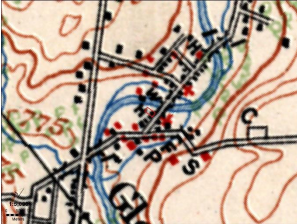
Figure 6: Subject property identified on the 1909 National Topographic Map