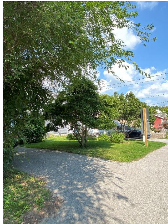
Figure 25: Looking northwest from Main Street towards the subject property (Town of Halton Hills 2024)