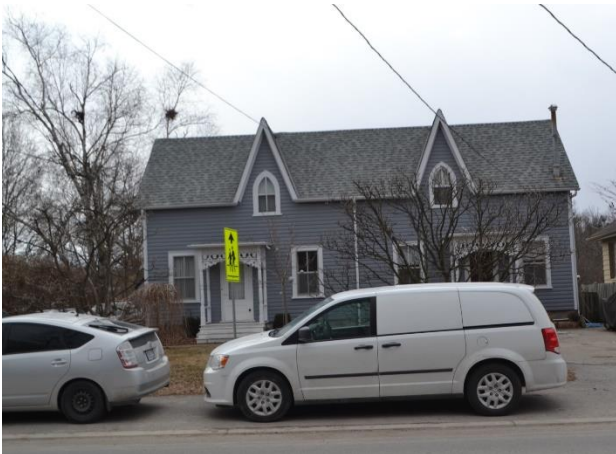
Figure 28: Front (east) elevation of the existing building at the subject property (File Photo n.d.)

Due to the building's setback from Main Street, adjacent buildings, and existing vegetation, the side (north and south) elevations are not highly visible from the right of way. The south and north elevations feature a single flatheaded opening at the first storey and symmetrically placed flatheaded window openings centered beneath the side gable at the second storey.