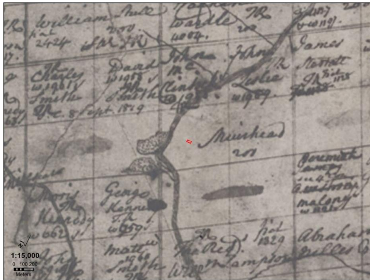
Figure 3: Subject property identified on the 1819 Patent Plan