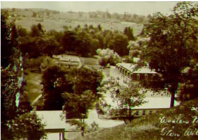
Figure 10: Beaumont Woollen Mills and home of Samuel Beaumont, looking west, c.1908 (EHS 11536)