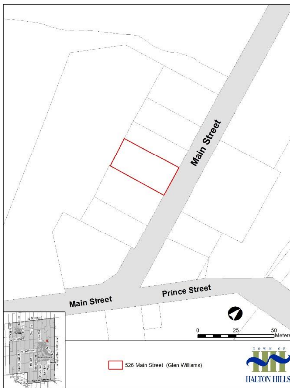
Figure 1: Location Map - 526 Main Street