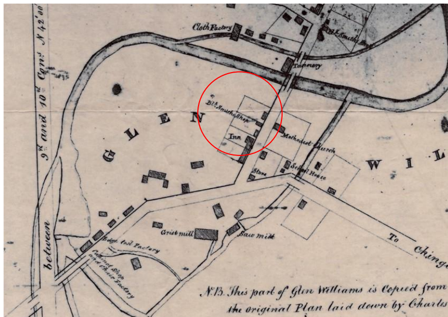
Figure 8: Subject property identified with blacksmith shop on the 1854 Plan of Part of the Village of Georgetown