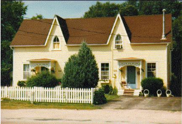
Figure 20: 526 Main Street, c.1990 (EHS 10806)