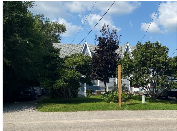
Figure 29: Looking toward the subject property (Town of Halton Hills 2024)