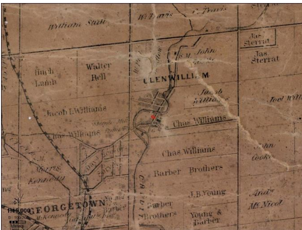
Figure 4: Subject property identified on Tremaine's 1858 Map of the County of Halton, Canada West