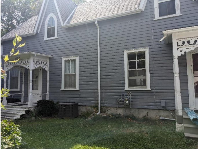
Figure 26: Partial front (east) elevation of the existing duplex at the subject property (Property Owner 2024)

The front elevation of the existing building reflects its duplex configuration, with two gable peaks above each entrance. Elaborately carved wooden porches are extant over each flatheaded entrance which are slightly off centre from the gable peaks above. Flatheaded window openings with wood sills and surrounds are extant on either side of each entrance, and a lancet arched window is extant beneath each gable peak. The foundation is visible below the contemporary siding on the front elevation and appears to be a parged stone foundation.