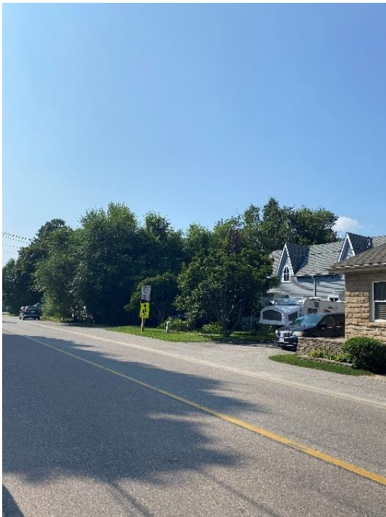
Figure 24: Looking south along Main Street; subject property shown to the right (Town of Halton Hills 2024)