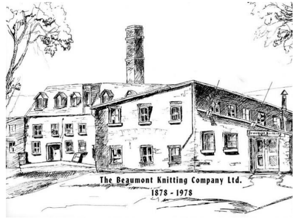
Figure 11: Sketch of the Beaumont Knitting Company Ltd. (EHS 02782)