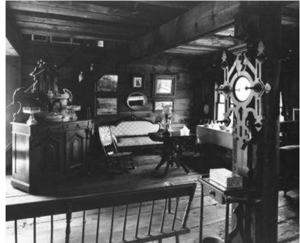
Figure 16: Interior of the barn housing Marie Beaumont Antiques, c.1962 (EHS 05696)