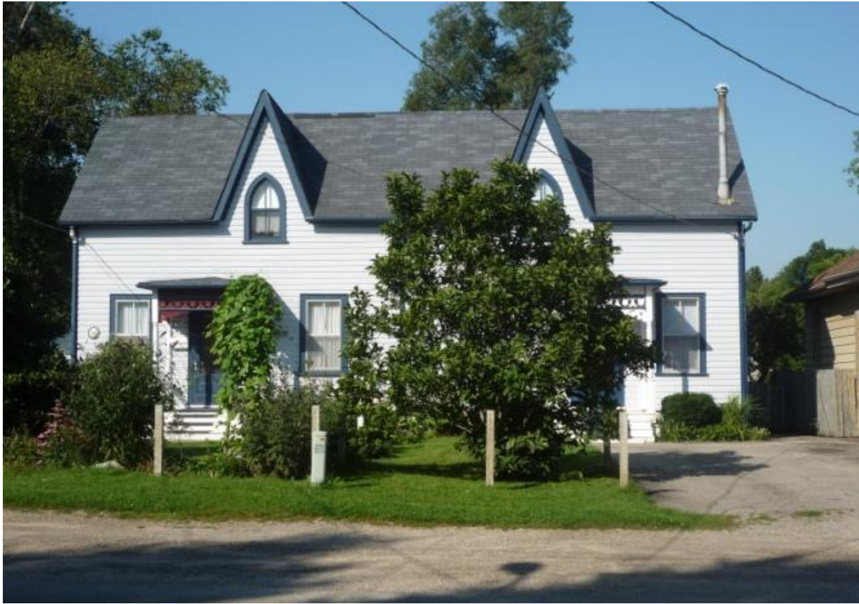
(Town of Halton Hills n.d.)