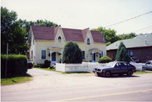
Figure 21: Subject property c.1990 (EHS 00933)