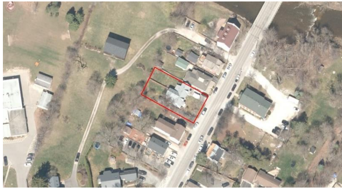
Figure 23: Subject property identified in 2023 aerial photography

The existing one-and-a-half storey building with steeply-pitched gable roof fronts onto Main Street in Glen Williams and is set back from the right of way. Initially, the dwelling was a multi-unit dwelling, however, has since been converted into a single-family dwelling. Staff photos have been supplemented with photos provided by the Owner and through historic street view images due to obstruction by foliage at the time of staff's site visits.