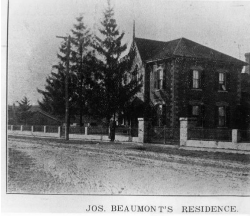
Figure 13: Joseph Beaumont House, c.1913 (EHS 00076)