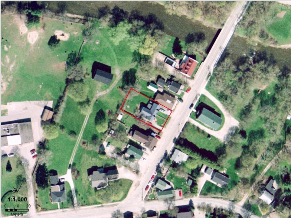
Figure 22: Subject property identified in 2002 aerial photography