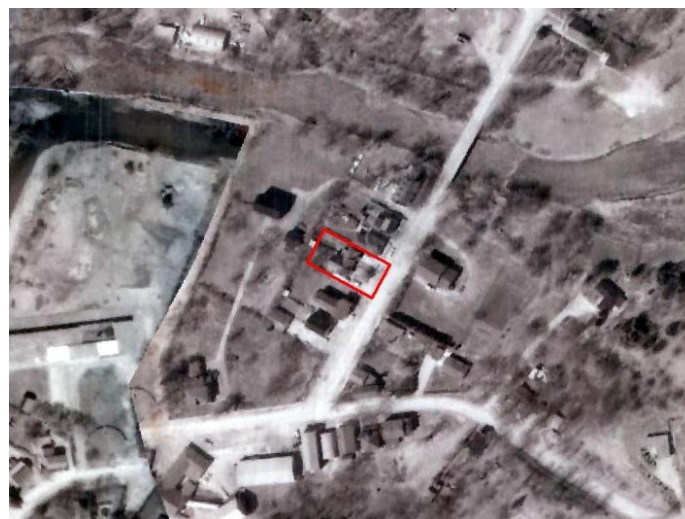
Figure 17: Subject property identified in 1977 aerial photography