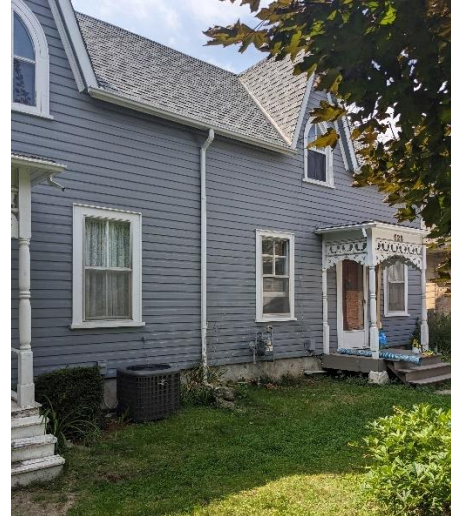
Figure 27: Partial front (east) elevation of the existing duplex at the subject property (Property Owner 2024)

Due to the building's setback from Main Street, adjacent buildings, and existing vegetation, the side (north and south) elevations are not highly visible from the right of way. The south and north elevations feature a single flatheaded opening at the first storey and symmetrically placed flatheaded window openings centered beneath the side gable at the second storey.