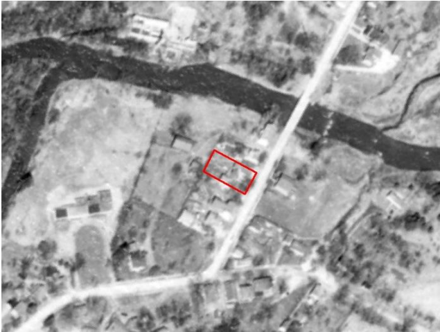
Figure 15: Subject property identified in 1960 aerial photography