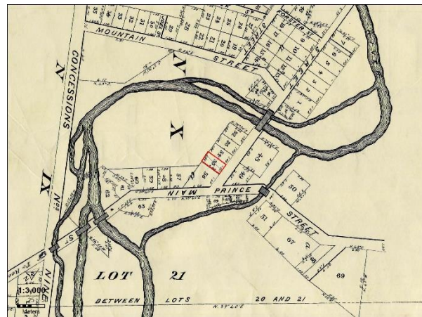
Figure 5: Subject property identified on the 1877 Illustrated Historical Atlas of the County of Halton