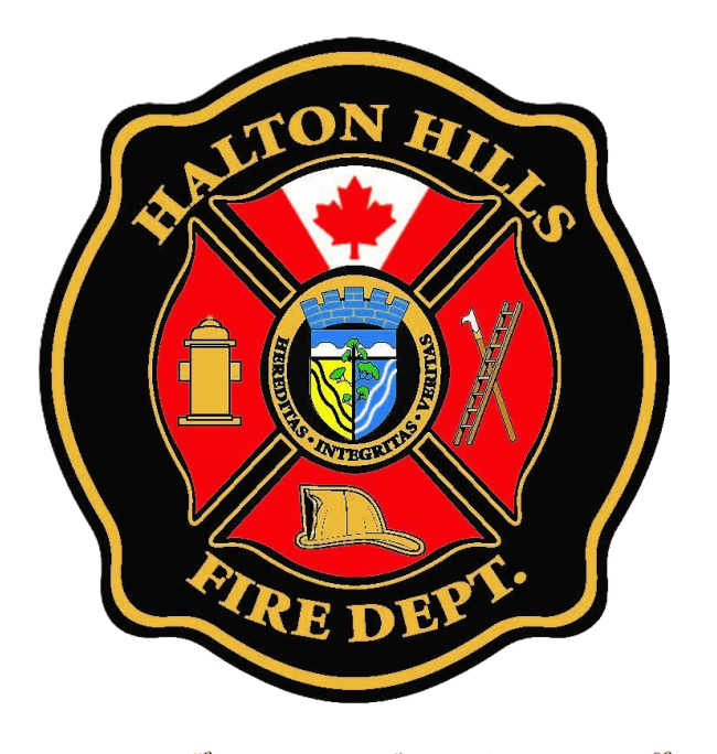
Our Family Protecting Your Family