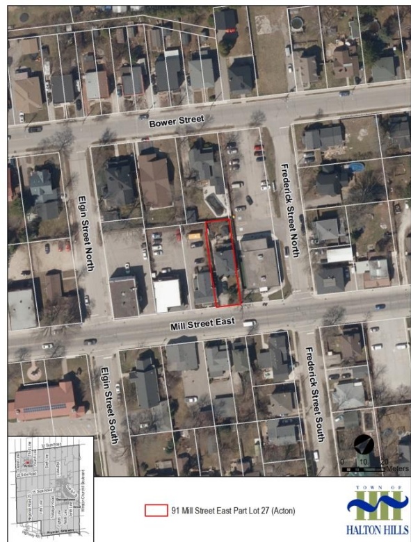
Figure 2: Aerial Photograph – 91 Mill Street East

This research and evaluation report describes the history, context, and physical characteristics of the property at 91 Mill Street East in Halton Hills, Ontario (Figure 1 and Figure 2). The report includes an evaluation of the property’s cultural heritage value as prescribed by the Ontario Heritage Act .