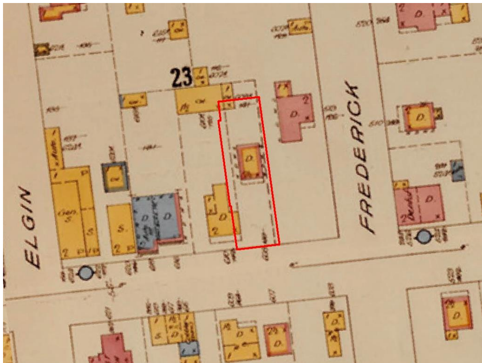
Figure 6: Subject property identified on the 1934 Fire Insurance Map