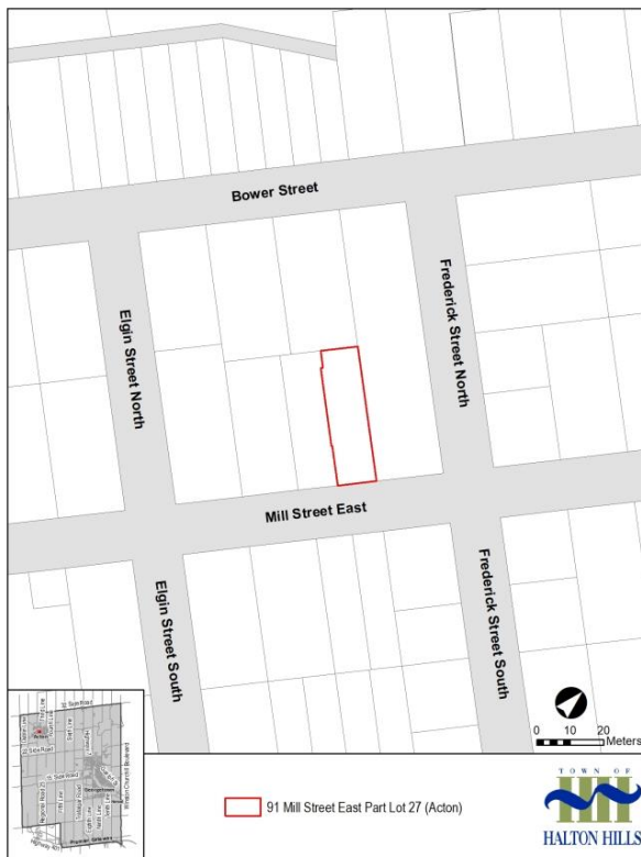
Figure 1: Location Map – 91 Mill Street East