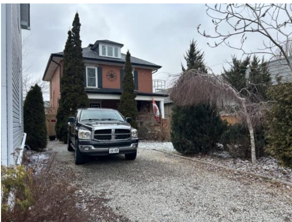
Figure 14: Looking towards the subject property from Mill Street East (Town of Halton Hills 2024)

The subject property is a rectangular shaped parcel located along the northwest side of Mill Street East; for the purposes of clarity, the primary elevation facing Mill Street East will be described as the south side. The property contains a two-and-a-half-storey frame residential building with brick veneer, set back from the street and accessed via a gravel driveway. The existing house features a hipped roof and is partially screened with mature trees and vegetation from the right of way.