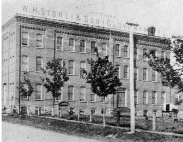
Figure 4: W.H. Storey and Son Glove Factory (EHS00383)