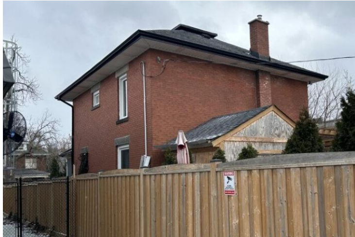
Figure 18: Looking towards the subject property from the rear yard of the adjacent property (Town of Halton Hills 2024)