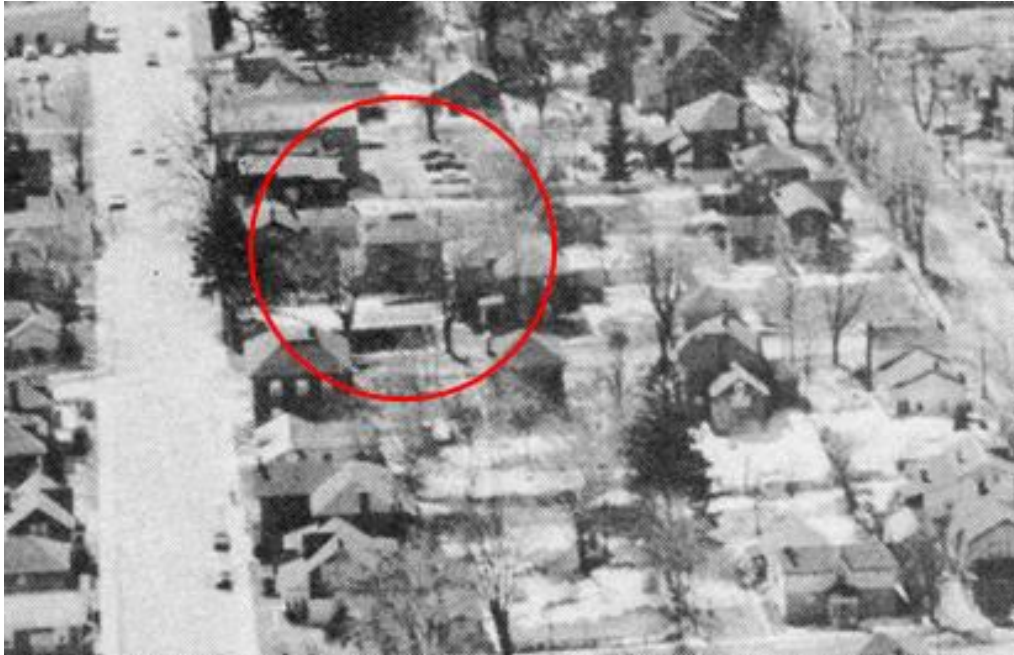
Figure 7: Subject property identified in 1971 aerial photography

91 Mill Street East | PT LT 27, BLK 5, PL 31, AS IN 743138 ALSO SHOWN ON PL 1098; TOWN OF HALTON HILLS