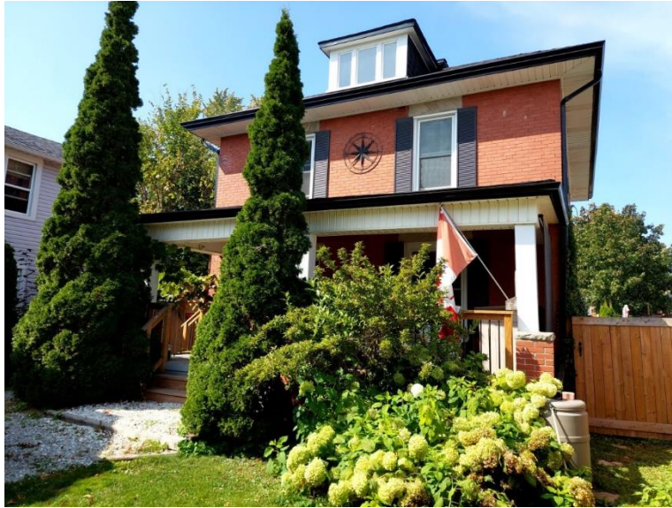
Figure 16: Looking towards the subject property from Mill Street East (Town of Halton Hills 2023)

The front (south) elevation features a covered porch extending across the front elevation along the first storey. The façade is simple in its layout with no additional ornamentation. The front entrance, accessed via the wooden front porch, is a flat-headed opening with stone lintel. A single flat-headed window opening is also located at the first storey adjacent to the entrance.