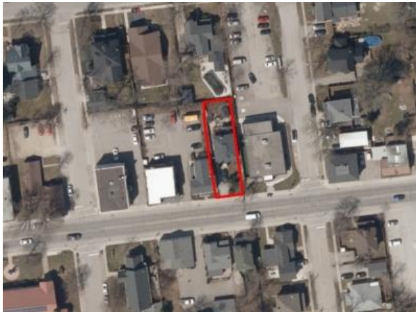
Figure 12: Subject property identified in 2023 aerial photography