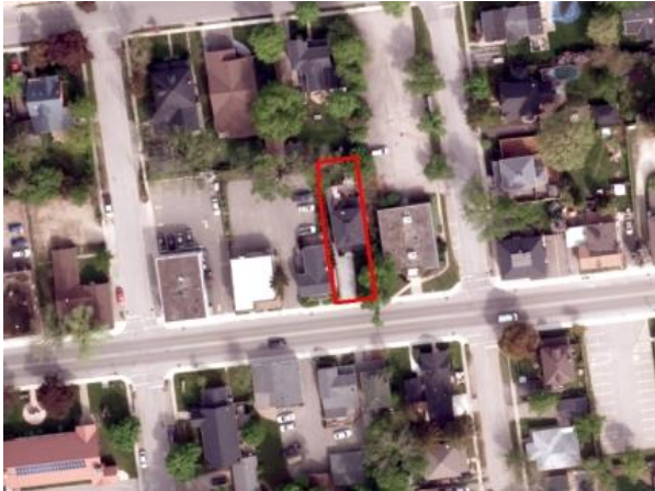
Figure 11: Subject property identified in 2017 aerial photography.