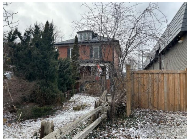
Figure 15: Looking towards the subject property from Mill Street East (Town of Halton Hills 2024)