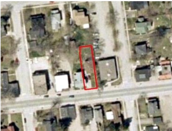
Figure 8: Subject property identified in 1999 aerial photography