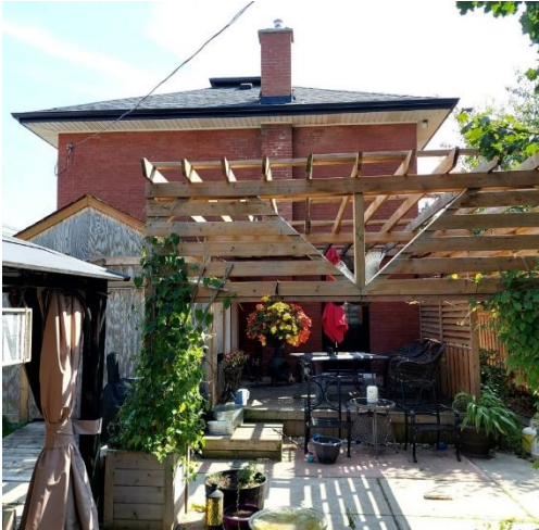
Figure 17: Rear elevation from within the subject property (Town of Halton Hills 2023)