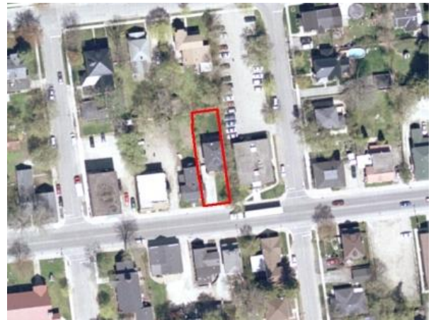
Figure 9: Subject property identified in 2005 aerial photography.