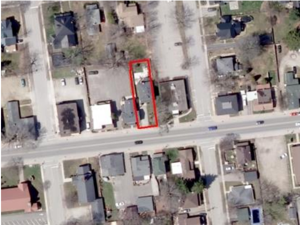
Figure 10: Subject property identified in 2011 aerial photography

91 Mill Street East | PT LT 27, BLK 5, PL 31, AS IN 743138 ALSO SHOWN ON PL 1098; TOWN OF HALTON HILLS