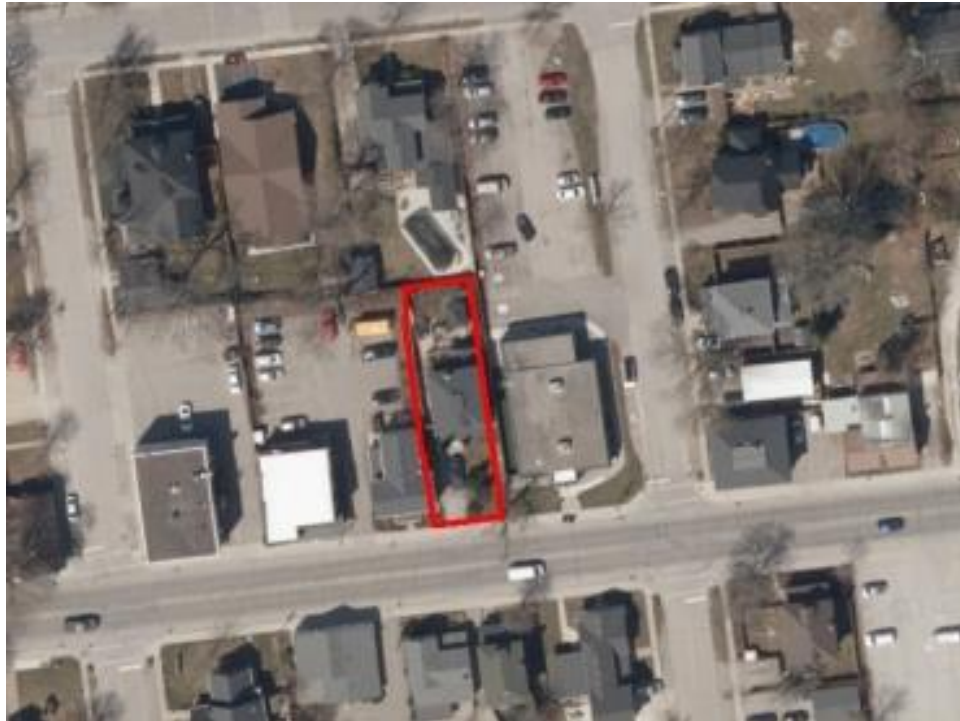
Figure 13: Subject property identified in 2023 aerial photography

The subject property is a rectangular shaped parcel located along the northwest side of Mill Street East; for the purposes of clarity, the primary elevation facing Mill Street East will be described as the south side. The property contains a two-and-a-half-storey frame residential building with brick veneer, set back from the street and accessed via a gravel driveway. The existing house features a hipped roof and is partially screened with mature trees and vegetation from the right of way.