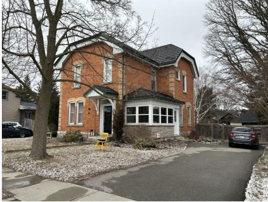
Figure 13: Looking towards the subject property from Frederick St N, showing the southwest (left) and southeast (right) elevations (Town of Halton Hills 2024)

A low wooden fence with gate extends along the rear of the driveway with a small, hipped-roof garage building at the rear of the property.