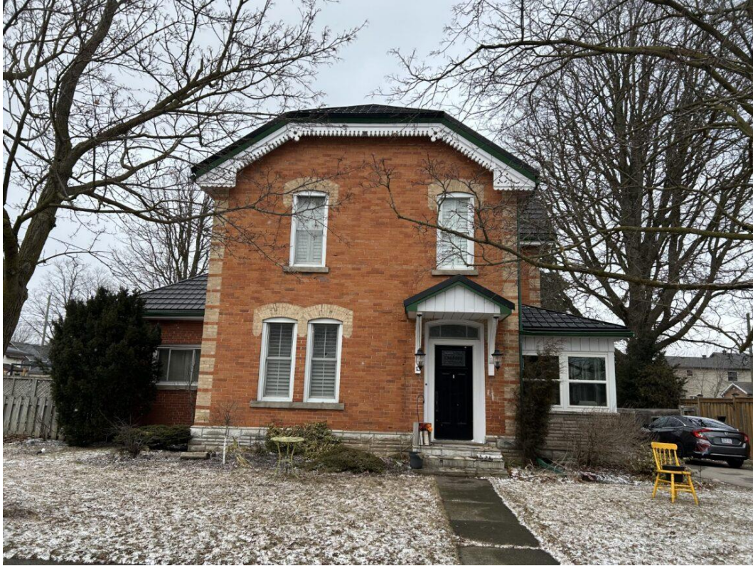
Figure 11: Southwest elevation of 13 Frederick St N (Town of Halton Hills 2024)

The side (northwest) elevation is partially obscured by a one-storey, hipped roof, brick addition which intersects the façade beyond the first bay. Single segmentally arched window openings with stone sills and buff brick voussoirs are located towards the front corner of the elevation. A small square window opening is located above the one-storey addition. A brick chimney extends above the roofline at the rear of the roofline. Segmentally arched window openings with buff brick voussoirs are located at the rear of the elevation beyond the addition.