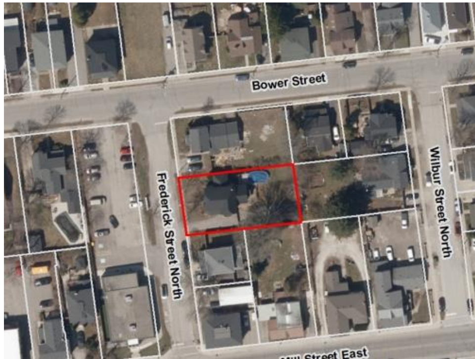
Figure 10: Subject property identified in 2023 aerial photography

The subject property is a rectangular shaped lot located along the northeast side of Frederick Street North in the community of Acton in the Town of Halton Hills. The property contains a two-storey brick building with one-storey additions. The property features a paved asphalt driveway along the southeast lot line and a paved walkway extending from Frederick Street North.