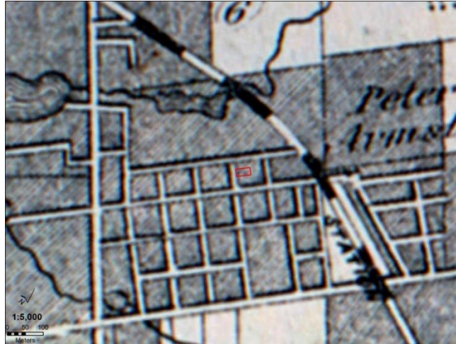
Figure 6: Subject property identified on the 1877 Illustrated Historical Atlas of the County of Halton