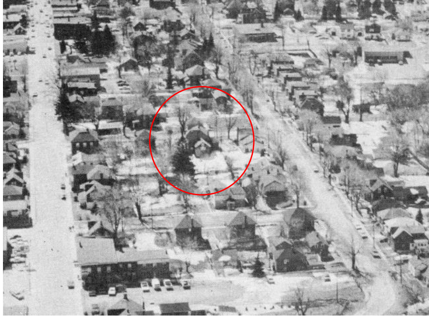
Figure 9: Subject property identified in 1971 aerial photography