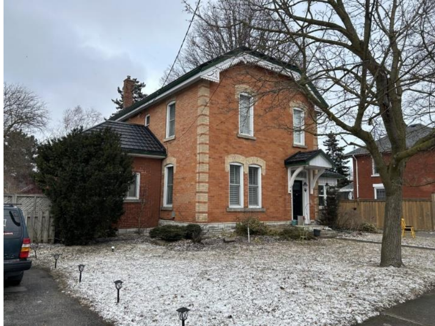
Figure 12: Looking towards the subject property from Frederick St N, showing the northwest elevation (left) and southwest elevation (right) (Town of Halton Hills 2024)

At the south corner of the existing building, a covered porch extends along the first storey with a single segmentally arched window opening visible at the second storey. Towards the rear, the two-storey building extends further to the south, featuring a similar roofline to the front elevation, two segmentally arched window openings with stone sills and buff brick voussoirs at the first storey and a similar single window opening centered above with a smaller rectangular window opening beside.