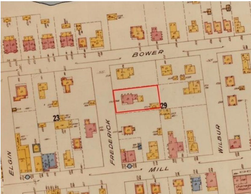
Figure 7: Subject property identified on the 1935 Fire Insurance Plan of Acton

The 1935 Fire Insurance Plan (Figure 7) shows the existing two-storey house with one-storey brick addition and one-storey frame addition to the rear. A frame garage is identified at the southeast corner of the property. The frame house adjacent to the subject property at the corner of Frederick and Bower is shown as well.