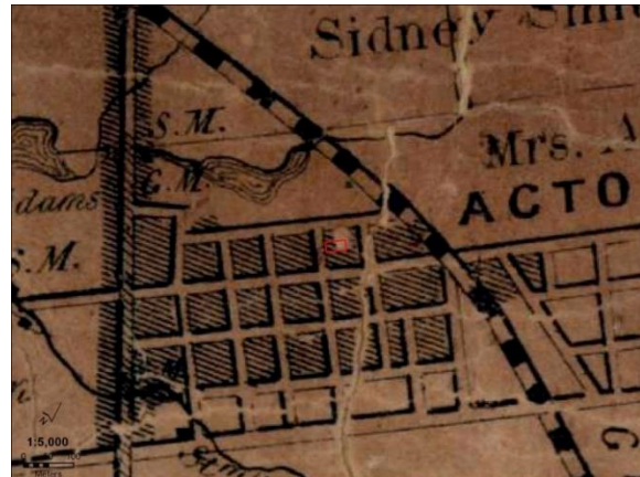
Figure 4: Subject property identified on Tremaine's 1858 Map of the County of Halton, Canada West