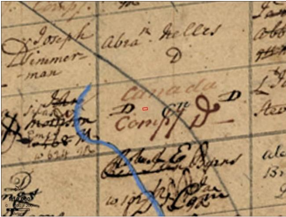
Figure 3: Subject property identified on the 1822 Patent Plan