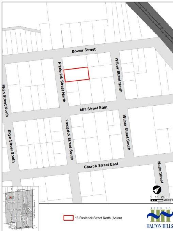
Figure 1: Location Map – 13 Frederick Street North