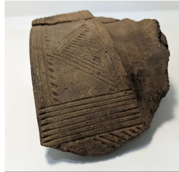
Pottery Vessel Rim