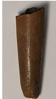
Pipe Mouthpiece And Stem