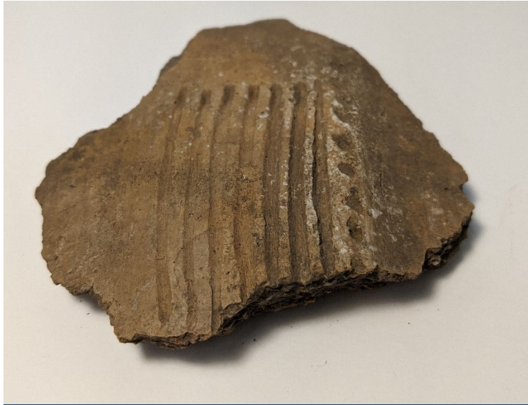
Pottery Vessel Rim