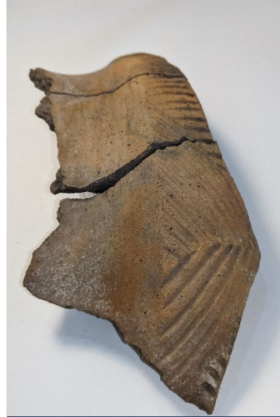
Pottery Vessel Rim