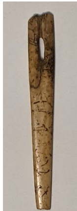
Bone Sewing Needle