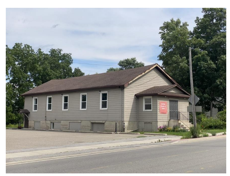
Figure 21: Looking towards St. Paul's Parish Hall at 16 Adamson Street South (Town of Halton Hills 2023)