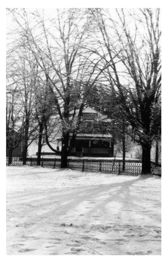
Figure 4: Anglican Rectory in Norval, c. 1928

While early church records highlight the men who helped establish and contribute to the growth of the congregation, women have been a significant part of the evolution of St. Paul's Anglican Church since its beginnings. Accounts from the mid-nineteenth century indicate the establishment of a Sunday School, and by the end of the nineteenth century several women were identified as teachers. Records from the late nineteenth and early twentieth centuries also indicate the creation of female-led groups, including the Ladies' Aid group and Woman's Auxiliary to the Missionary Society of the Church of England in Canada. These groups were instrumental in fundraising initiatives, local service within the community, and foreign missions.