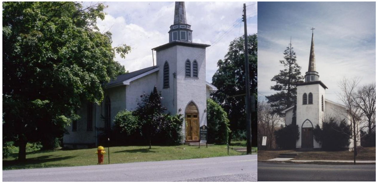
Figure 13: St. Paul's Anglican Church at 12 & 16 Adamson Street South, July 1986 (EHS17571)