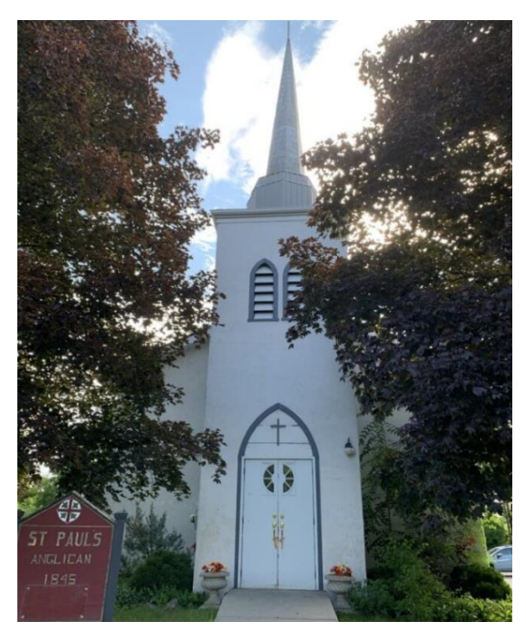
Figure 16: Front elevation of St. Paul's Anglican Church at 12 & 16 Adamson Street South (Town of Halton Hills 2023)