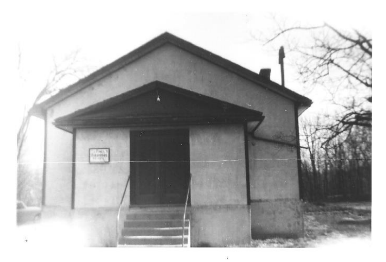
Figure 8: St. Paul's Anglican Church Hall on Adamson Street, c.1960, showing the addition of the new vestibule on the front elevation (EHS21790)