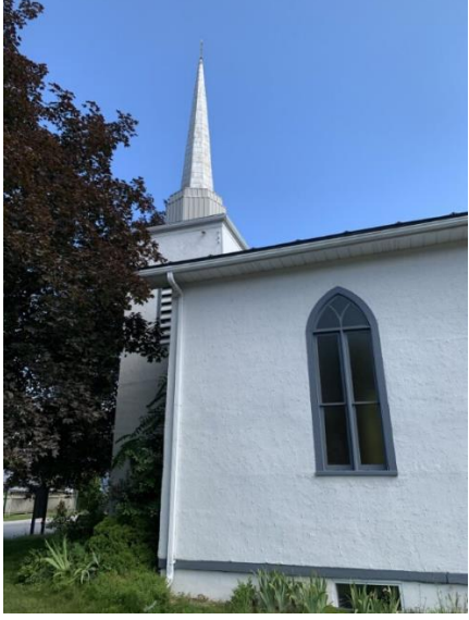
Figure 20: Detail of south elevation of St. Paul's Anglican Church (Town of Halton Hills 2023)

The c.1927 Parish Hall (Figure 21 and Figure 22) is located to the south of the existing church building beyond the asphalt parking lot. The existing one-storey frame building has a gable roof and a small gable-roofed vestibule, accessed via a flight of steps extending from a walkway from the existing sidewalk along Adamson Street South. The concrete foundation features rectangular window openings at the basement level (infilled), and five rectangular window openings symmetrically placed along the side elevations. The vestibule entrance (not original to the c.1927 building) features a double door with rectangular window openings on each side elevation.