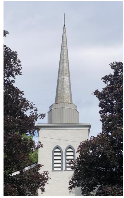
Figure 17: Detail of church steeple at front elevation of St. Paul's Anglican Church (Town of Halton Hills 2023)

The front (west) elevation of St. Paul's Anglican Church is dominated by its central tower, including the entrance within a lancet-arched opening, with lancet-arched louvered openings beneath the existing steeple and spire (Figure 16 and Figure 17). The exterior of the church is stuccoed, while the steeple is clad with metal flashing. The bays on either side of the central tower feature blank stuccoed facades with no window or door openings.