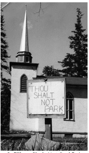
Figure 9: "Thou Shalt Not Park" sign at St. Paul's Anglican Church, c.1966 (EHS02700)

Extensive renovations were made to the church during the 1940s and 1950s, including a basement, furnace, new chimney, stucco renovation, painting on the interior and exterior, lowering the ceiling, relocating the old vestry to the basement, reconstructing the altar rail, installing a new organ, and a cross on the church steeple.