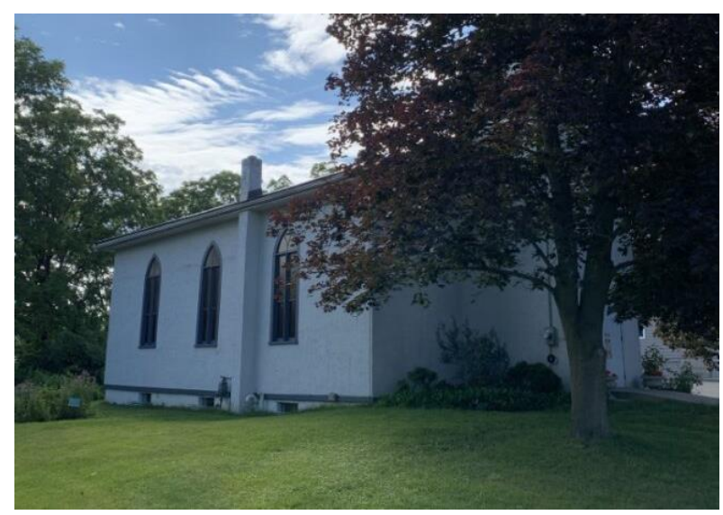
Figure 18: North elevation of St. Paul's Anglican Church at 12 & 16 Adamson Street South (Town of Halton Hills 2023)