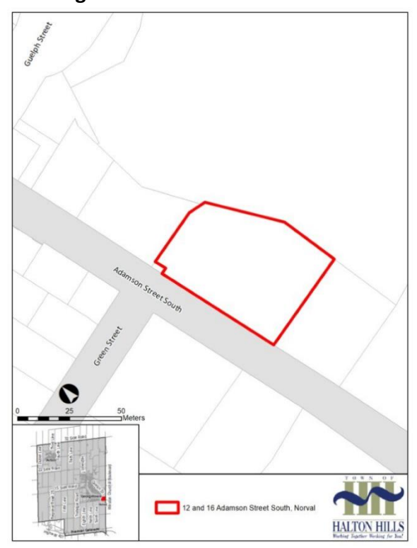
Figure 1: Location Map – 12 & 16 Adamson Street South