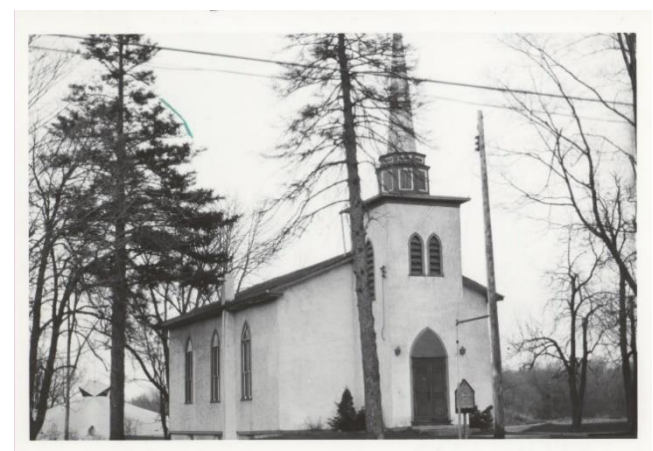
Figure 11: St. Paul's Anglican Church, Norval. April 1973 (EHS13500)