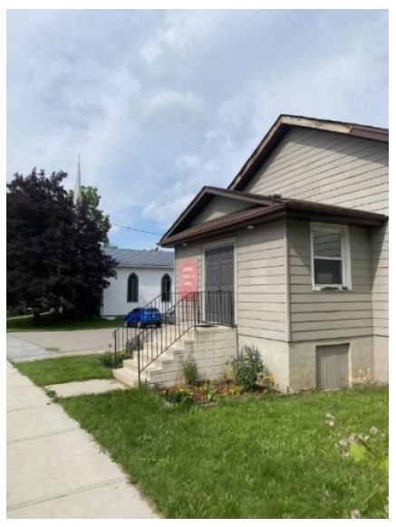
Figure 22: Southwest corner of St. Paul's Parish Hall at 16 Adamson Street South, showing St. Paul's Anglican Church in the background (Town of Halton Hills 2023)

The interiors of the church building and Parish Hall, and the rear elevations of both were not included as part of the evaluation of the existing property for its cultural heritage value.