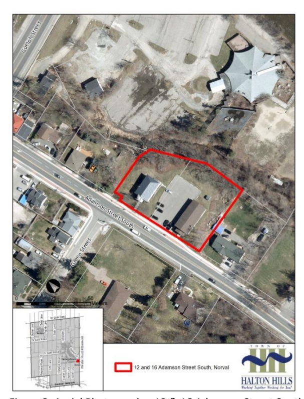
Figure 2: Aerial Photograph – 12 & 16 Adamson Street South (2021)

This research and evaluation report describes the history, context, and physical characteristics of the properties at 12 & 16 Adamson Street South in Halton Hills, Ontario (Figure 1 and Figure 2). The report includes an evaluation of the property's cultural heritage value as prescribed by the Ontario Heritage Act .