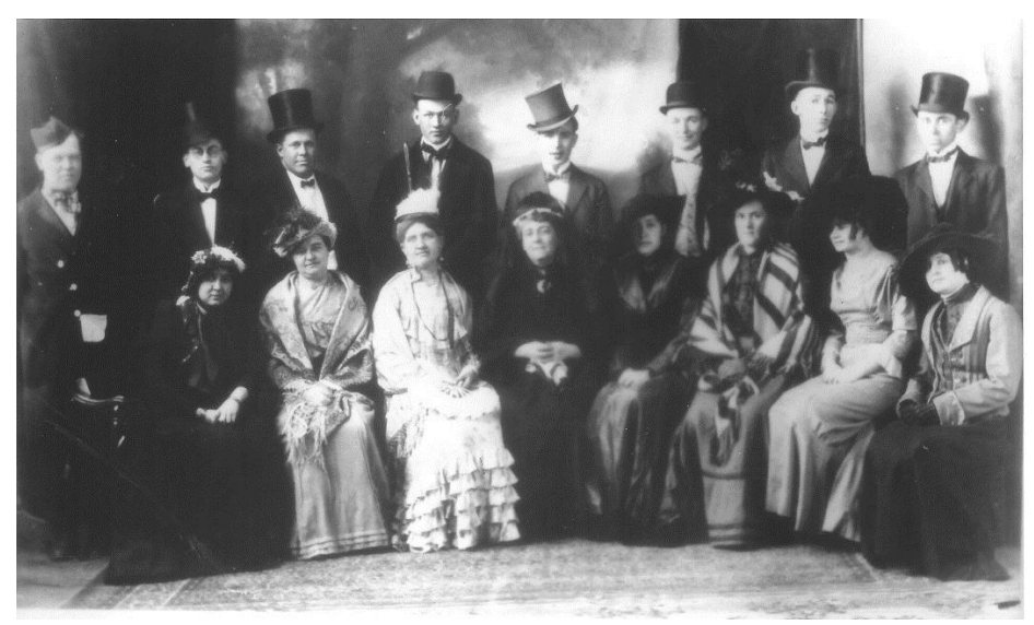
Figure 5: The Norval Dramatic Players in costume at St. Paul's Parish Hall. The organizer, Lucy Maud Montgomery sits in a widow's dress front row centre, c.1927 (EHS21811)