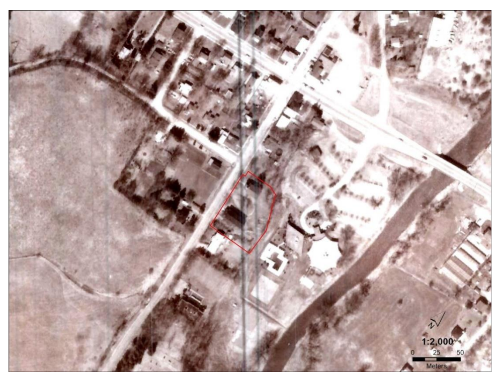
Figure 12: 1977 Aerial Photo, showing the existing properties at 12 & 16 Adamson Street South