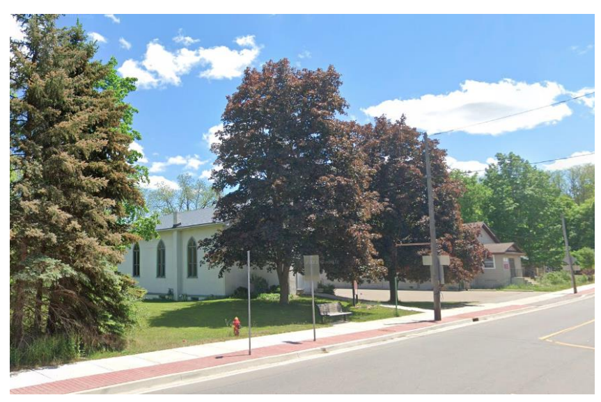
Figure 15: Looking southeast along Adamson Street in Norval towards 12 & 16 Adamson Street South

The property at 12 and 16 Adamson Street South is located along the east side of Adamson Street South in the community of Norval, west of the Credit River. The property includes a one-storey frame church building within the north portion of the property and a one-storey parish hall building within the south portion. A paved parking lot is located between both buildings and mature trees are located along the rear (east) property line; two mature deciduous trees are located on either side of the central entrance to the church building, accessed via a paved walkway from the existing sidewalk along Adamson Street South. A painted wooden sign identifying "St. Paul's Anglican 1845" is located on the north side of the walkway (Figure 15 through Figure 17).