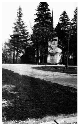
Figure 6: St. Paul's Anglican Church, Norval