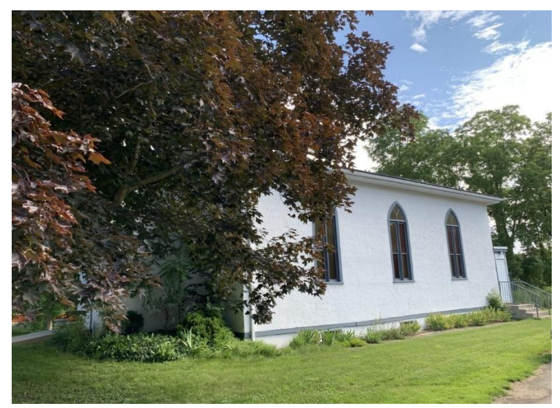
Figure 19: South elevation of St. Paul's Anglican Church (Town of Halton Hills 2023)