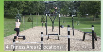
4. Fitness Area (2 locations)