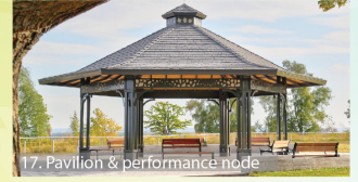
17. Pavilion & performance node