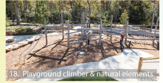
18. Playground climber & natural elements