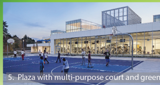
5. Plaza with multi-purpose court and green islands