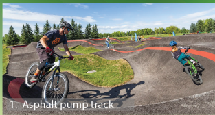
1. Asphalt pump track