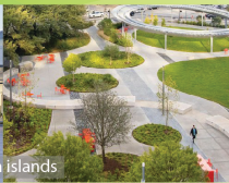
7. Walkway within parking