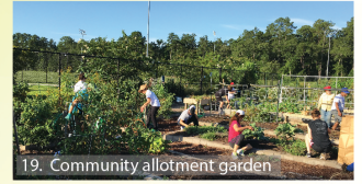
19. Community allotment garden