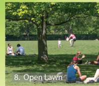
8. Open Lawn