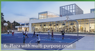
6. Plaza with multi-purpose court