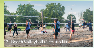
2. Beach Volleyball (4 courts lit)