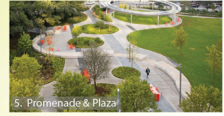
5. Promenade & Plaza