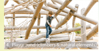
4. Playground (climbers & natural elements)