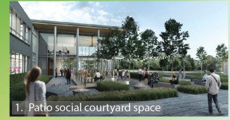
1. Patio social courtyard space