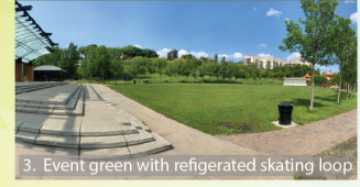
3. Event green with refrigerated skating loop