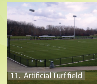
11. Artificial Turf field