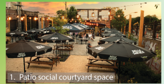
1. Patio social courtyard space