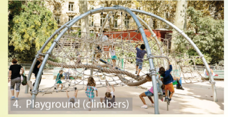
4. Playground (climbers)