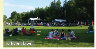
5. Event lawn