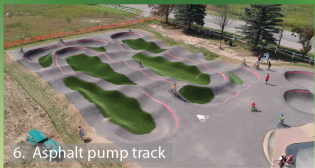
6. Asphalt pump track