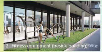
2. Fitness equipment (beside building)