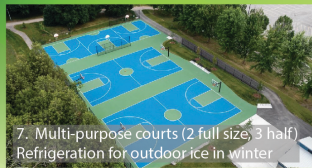
7. Multi-purpose courts (2 full size, 3 half) Refrigeration for outdoor ice in winter