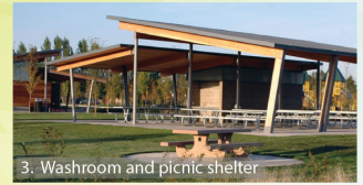
3. Washroom and picnic shelter