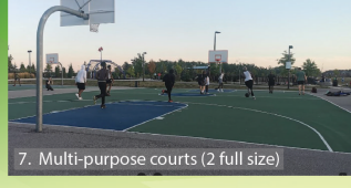
7. Multi-purpose courts (2 full size)