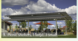
3. Picnic shelters, 1 large, 3 small