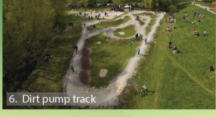
6. Dirt pump track