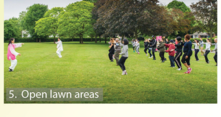
5. Open lawn areas