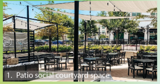
1. Patio social courtyard space