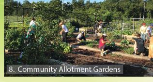
8. Community Allotment Gardens