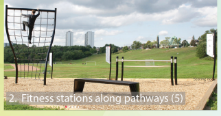
2. Fitness stations along pathways (5)