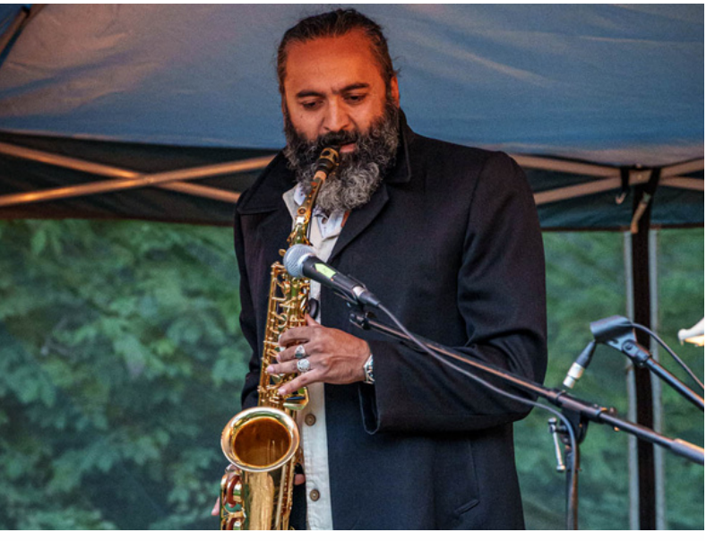
Autumn Equinox at House Sol