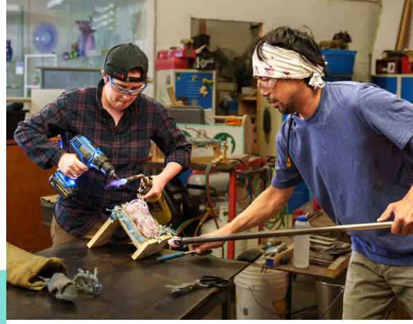
Open Studio Day at Glen Williams Glass

All activities are free or paywhat-you-can