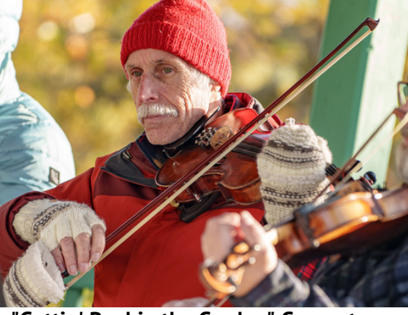
"Gettin' Reel in the Garden" Georgetown Folk Collective