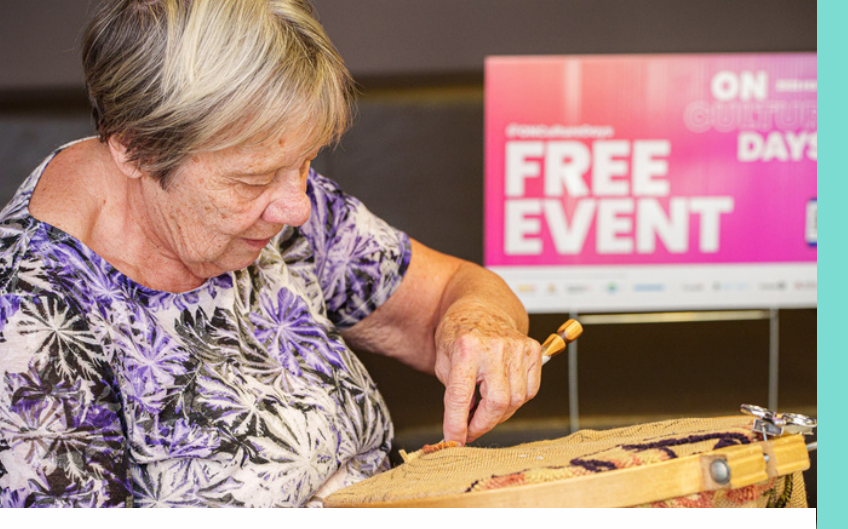
Show and Demonstration with the Georgetown Rug Hooking Guild

"Well run, good interactions with public, very cool projects - particularly new public art is exciting to see."