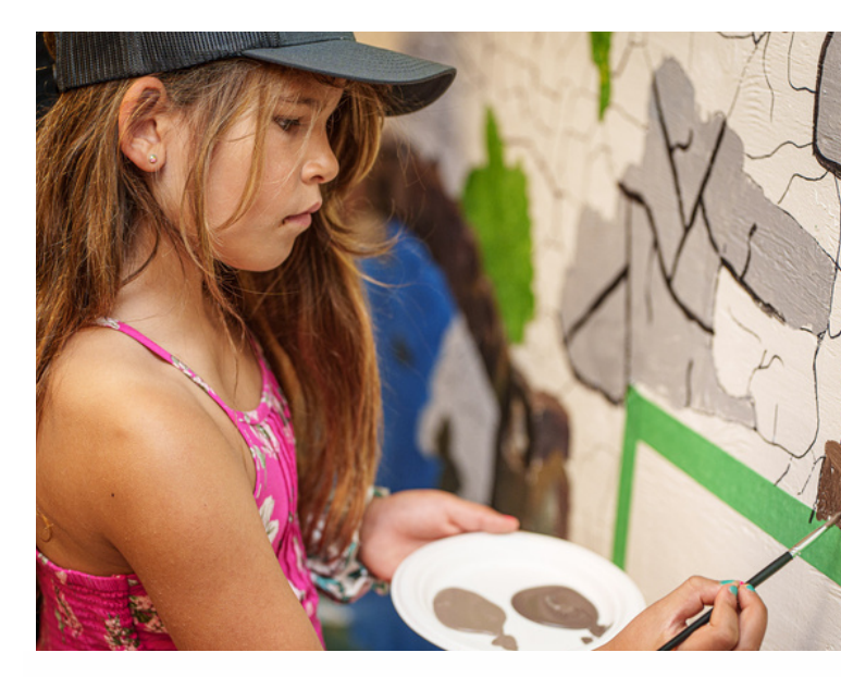
Community Colouring Page by Colour it Air