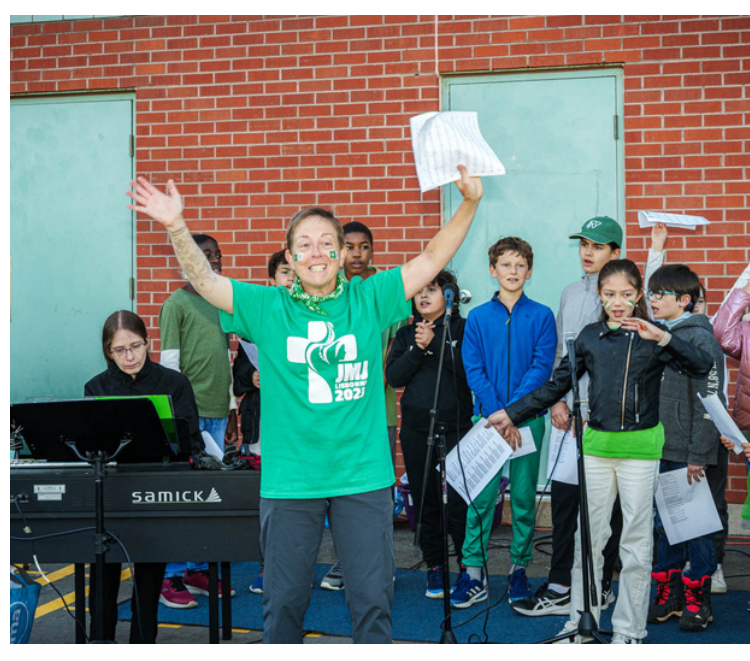
Franco Ontarien Flag Day by Le Coin Franco