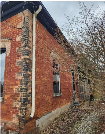
Figure 15: Southwest corner of subject building showing side (south) elevation at 20 Queen Street (Town of Halton Hills 2023)

The side elevations feature paired segmentally arched windows with stone sills and brick voussoirs and stone hood moulds (Figure 15 and Figure 16). Original shutters are extant on one window on both the north and south elevations (Figure 16). The stone foundation is paraged along both side elevations.