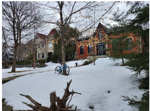
Figure 9: Looking north along Queen Street towards the subject property (Town of Halton Hills 2023)