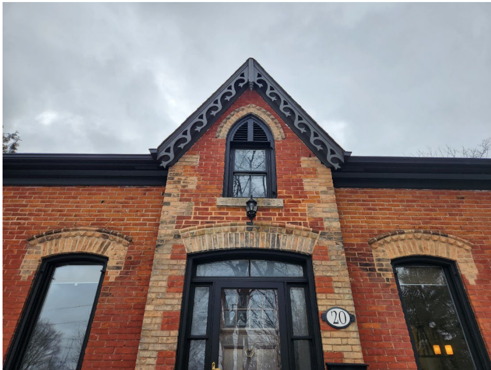
Figure 13: Detail of upper front (southwest) elevation, 20 Queen Street (Town of Halton Hills 2023)

At the upper storey , a gothic arched window opening with stone sill and hood mould is situated beneath the gable peak, with wooden gingerbread detailing below the eaves, which throughout the roofline feature wooden soffits (Figure 13 and Figure 14). Windows have been replaced throughout the subject building.