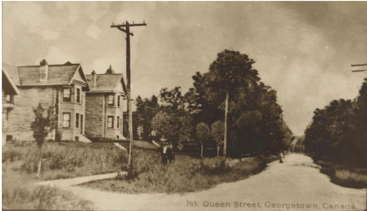
Figure 6: This postcard shows Queen Street as an overgrown dirt lane with two gentlemen posing for the camera on the sidewalk. Shown (left to right) are the corner of #26, #24, #22 and the white quoins of the red brick house at #20 Queen Street (EHS13481)