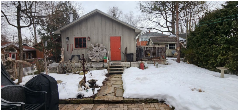
Figure 18: Southwest elevation of garage at the rear of the property, 20 Queen Street (Town of Halton Hills 2023)

A one-storey frame garage building is located to the rear of the existing house (Figure 18)