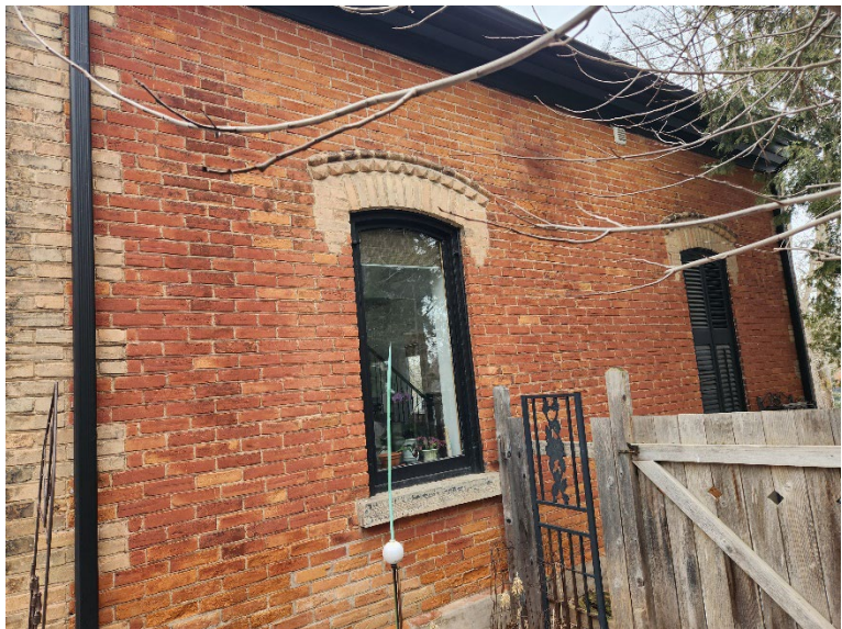
Figure 16: North elevation, 20 Queen Street (Town of Halton Hills 2023)