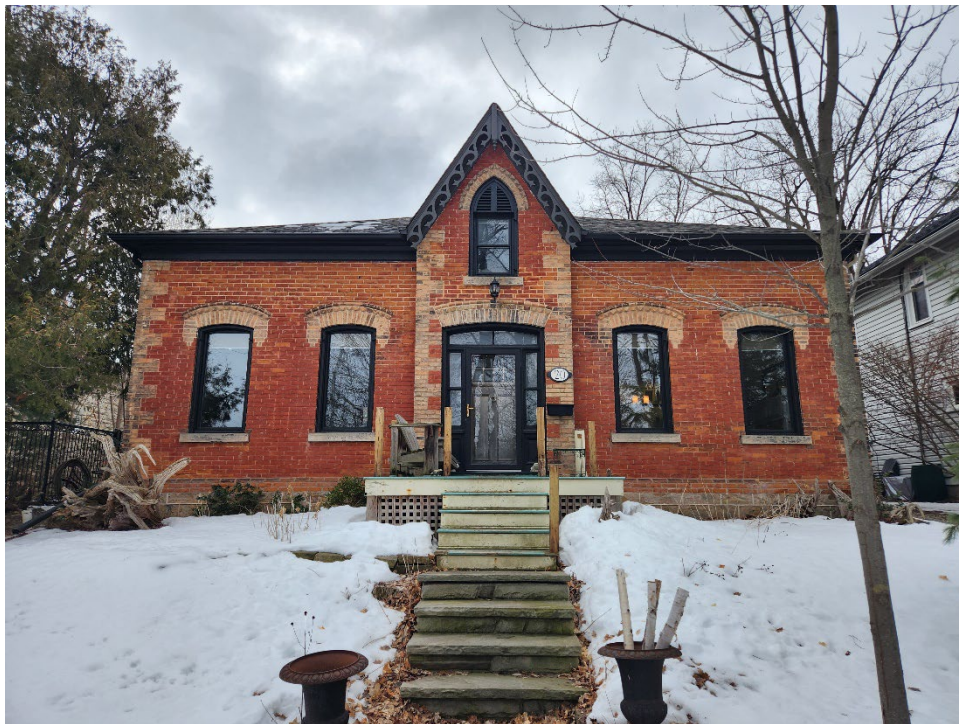
Figure 10: Front (northwest) elevation of 20 Queen Street (Town of Halton Hills 2023)

The subject property contains a one-and-a-half-storey residential building with hipped roof situated within the central portion of the treed lot, with a one-storey garage at the rear accessed via a laneway from Albert Street. The house sits above street level upon a grassed slope, with a stepped dry stone retaining wall above the sidewalk along Queen Street (Figure 8). The one-and-a-half storey dichromatic brick structure features red brick masonry with yellow brick quoining at the corners and a central bay with yellow brick quoining and gable roof within the centre of the front elevation. A paved walkway extends from the sidewalk up the grass lawn, with a flight of four stone steps extending to the base of the wooden porch providing access to the front entrance (Figure 11). The painted wooden porch has no roof and features squared posts and railings with simple detailing and wooden lattice beneath the porch (Figure 12). The central entrance within a projecting bay features a rounded-arched entrance opening with wooden transom and sidelights with stone detailing above, with paired, symmetrically placed windows with stone hood moulds on either side of the central bay (Figure 8 and Figure 12).