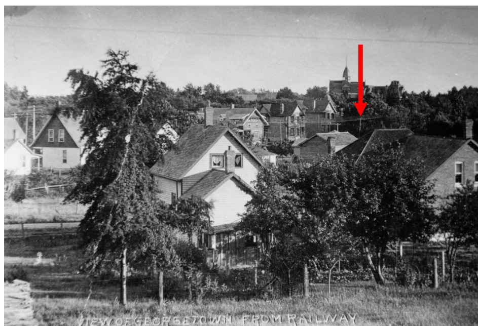
Figure 3: View of Georgetown from Railway, c.1909. Arrow identifies location of subject property however the house is not visible (EHS 11638)