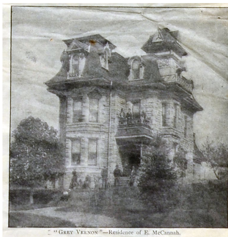
Figure 5: Grey Vernon (Toronto Daily Mail, June 24, 1893)