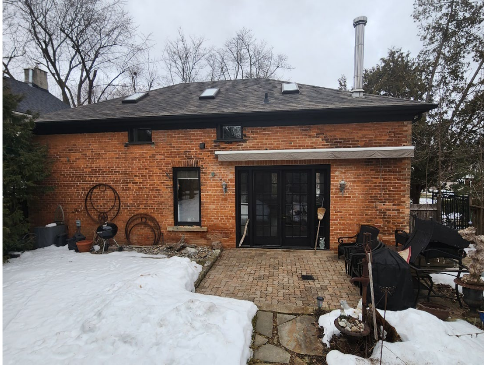
Figure 17: Rear (southeast) elevation, 20 Queen Street (Town of Halton Hills 2023)

The rear elevation contains irregular window openings with an intervention for a contemporary door opening beneath a retractable canopy (Figure 17). Three skylights are featured on the rear slope of the roof adjacent to a contemporary chimney. Infill brick throughout the rear elevation demonstrates modifications to the rear wall of the building over time.