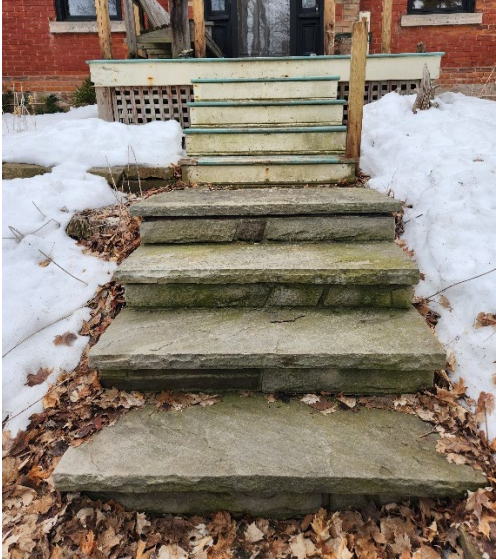
Figure 11: Front porch detail, 20 Queen Street (Town of Halton Hills 2023)