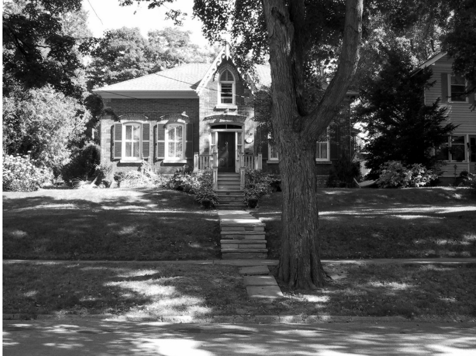
Figure 7: 20 Queen Street, c. 2002 (EHS 15031)