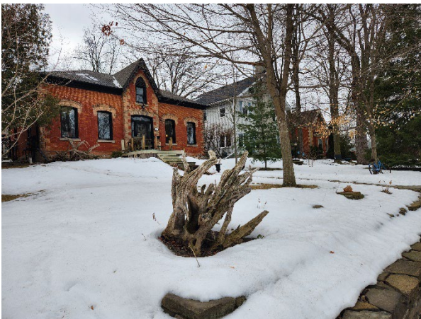
Figure 8: Looking south along Queen Street towards the subject property (Town of Halton Hills 2023)

The property is located at 20 Queen Street, Georgetown, Halton Hills, and is a rectangular parcel situated along the southeast side of Queen Street (Figure 9 and Figure 10). The property is legally known as PT LTS 8 & 9, PL 37 , SE OF QUEEN ST, AS IN 761809; TOGETHER WITH AN EASEMENT AS IN 761809 TOWN OF HALTON HILLS.