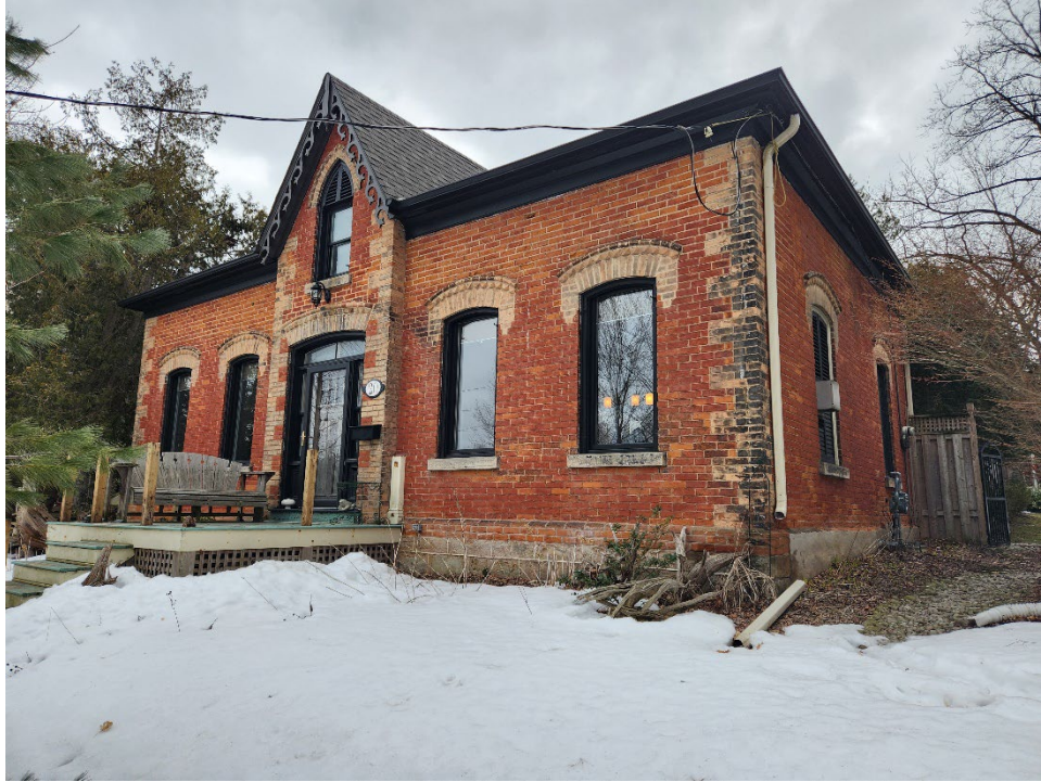
Figure 14: Southwest corner of 20 Queen Street

The side elevations feature paired segmentally arched windows with stone sills and brick voussoirs and stone hood moulds (Figure 15 and Figure 16). Original shutters are extant on one window on both the north and south elevations (Figure 16). The stone foundation is paraged along both side elevations.