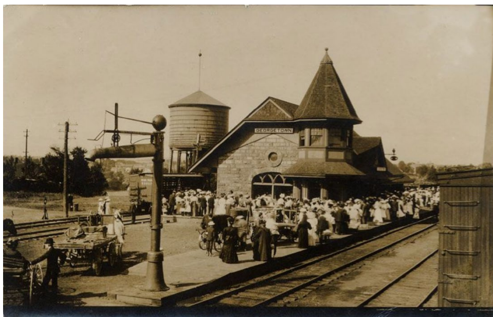
Figure 2: A crowd waits for the train outside the Grand Trunk Railway Station in Georgetown, c.1908 (EHS p315f)