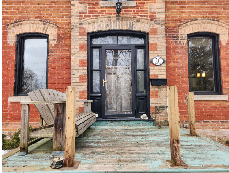
Figure 12: Front entrance and porch detail, 20 Queen Street (Town of Halton Hills 2023)

At the upper storey , a gothic arched window opening with stone sill and hood mould is situated beneath the gable peak, with wooden gingerbread detailing below the eaves, which throughout the roofline feature wooden soffits (Figure 13 and Figure 14). Windows have been replaced throughout the subject building.