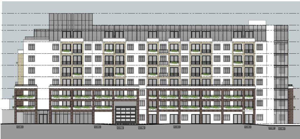
BUILDING - 3 _ WEST ELEVATION _ SCALE 1:200