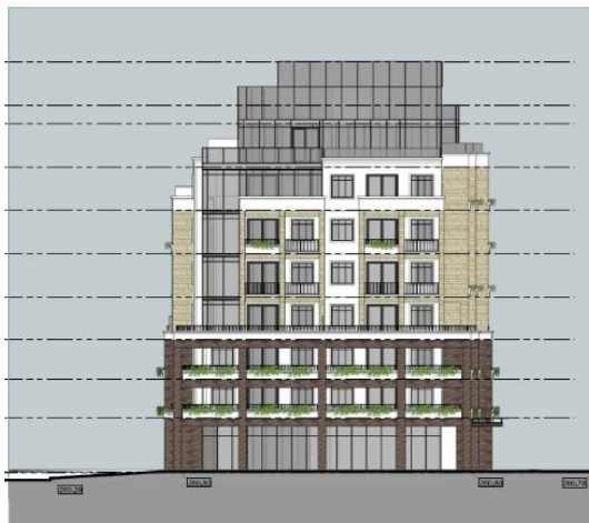
BUILDING - 3 _ NORTH ELEVATION _ SCALE 1:200