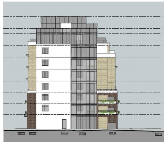
BUILDING - 3 _ SOUTH ELEVATION _ SCALE 1:200