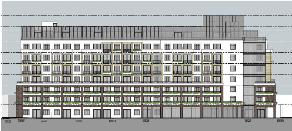
BUILDING - 3 _ EAST ELEVATION _ SCALE 1:200