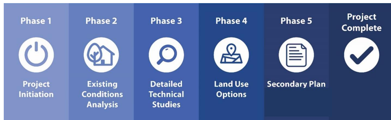
Figure 1: Study Phases

The following background reports were completed in order to lay the groundwork for the detailed planning and analysis in the following phases of the Study: