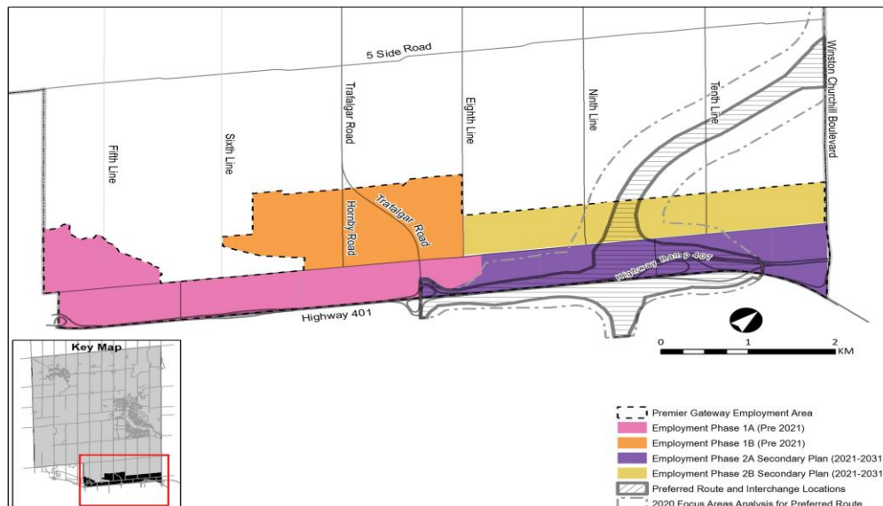
Map 1: Study Area

The Premier Gateway Phase 2B area (shown in yellow on Map 1) is planned to accommodate employment development to the year 2031. The Secondary Plan will help establish the basis for new development to occur and contribute to achieving the Town's economic objectives.