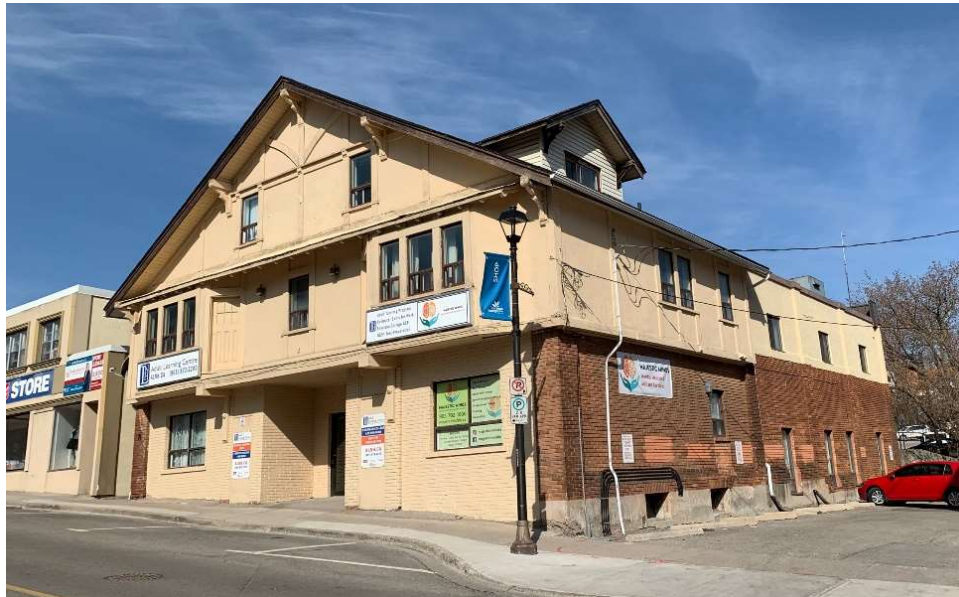
Figure 12: Former Gregory Theatre building along Mill Street (Town of Halton Hills 2022)

The property at 72 Mill Street is located in the community of Georgetown in the Town of Halton Hills and contains one structure. The c.1958 building is comprised of a two-and-a-half storey structure with gable roof and a two-storey flat-roofed portion towards the rear (Figure 12). As previously indicated, the original Gregory Theatre building was reconstructed by original builder J.M. Mackenzie, following a fire that destroyed the original building in 1958. Original architectural features and detailing, including the original front elevation features and original windows, are no longer extant.