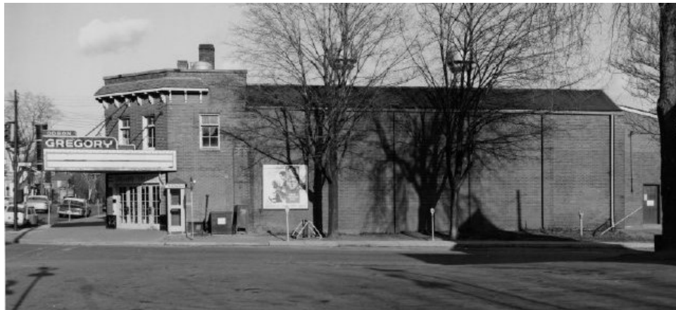
Figure 7: The Gregory Theatre in Oakville, c.1961