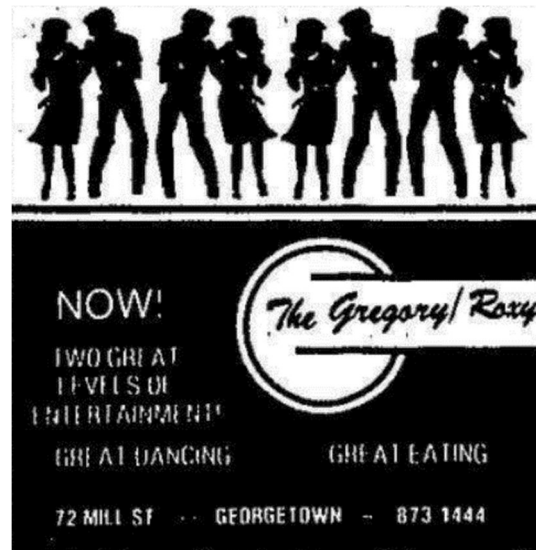
Figure 10: Advertisement for The Gregory/Roxy in The Herald (The Georgetown Herald, April 18, 1964, p.11)

In 1963, The Gregory Restaurant opened in the former theatre building, while downstairs the Roxy lounge opened as an entertainment venue (Figure 10). An article in the February 11, 1963 edition of The Herald notes that plans were being considered for a piano bar in The Gregory Restaurant, a dinner-theatre at The Roxy, and an outdoor café.