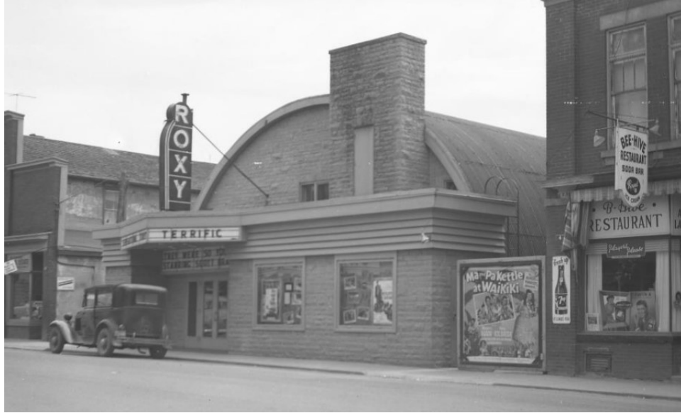
Figure 6: The former Roxy Theatre at 6 Mill Street East in Acton, c.1955 (EHS25052)

In Oakville, Gregory constructed the Gregory Theatre on Dundas Street, also in the 1920s (Figure 7). The Gregory Theatre featured both live performances and films, closing in 1962 like many local theatres at that time. Gregory is identified in voter's lists in 1940 as living on Dundas Street (now Trafalgar Road) in Oakville. Gregory also reportedly had theatres in Erin, Rockwood, and Brampton.