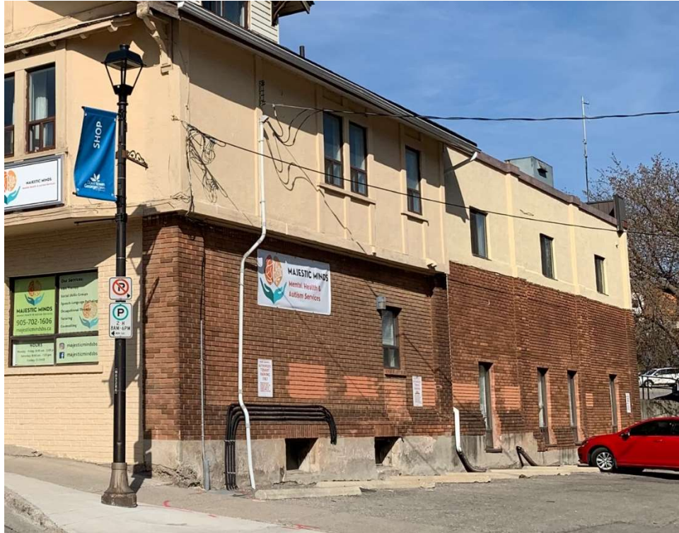
Figure 15: Side elevation of the former Gregory Theatre building (Town of Halton Hills 2022)

The rear elevation faces onto a municipal parking lot. The two-storey elevation is stuccoed and features an entrance with double doors beneath a canopy and two rectangular window openings at the second storey (Figure 16).