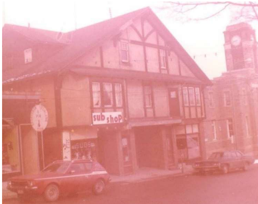
Figure 11: Photograph of the former Gregory Theatre c. 1970s

A photograph from the 1970s shows the first storey of the theatre with unpainted half-timbering on the upper storeys, prior to modifications to the first storey and subsequent painting of the building (Figure 11).