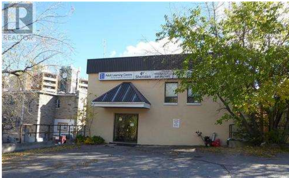
Figure 16: Rear elevation of the former Gregory Theatre

The rear elevation faces onto a municipal parking lot. The two-storey elevation is stuccoed and features an entrance with double doors beneath a canopy and two rectangular window openings at the second storey (Figure 16).