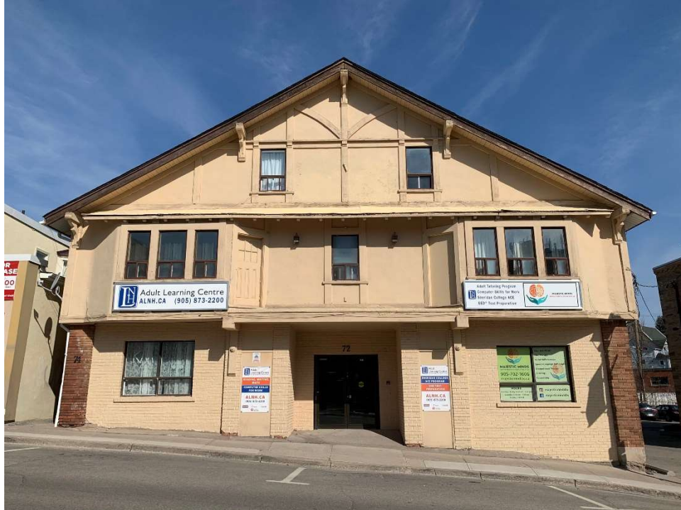
Figure 13: Front elevation of the former Gregory Theatre (Town of Halton Hills 2022)

Gable-roofed dormers are located along the sides of the roof and feature small rectangular window openings and decorative brackets on the south elevation and a single slider window and bracketed eaves on the north elevation (Figure 14).