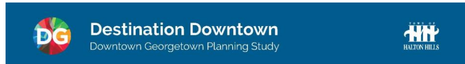
Figure 2: Draft Vision and Principles