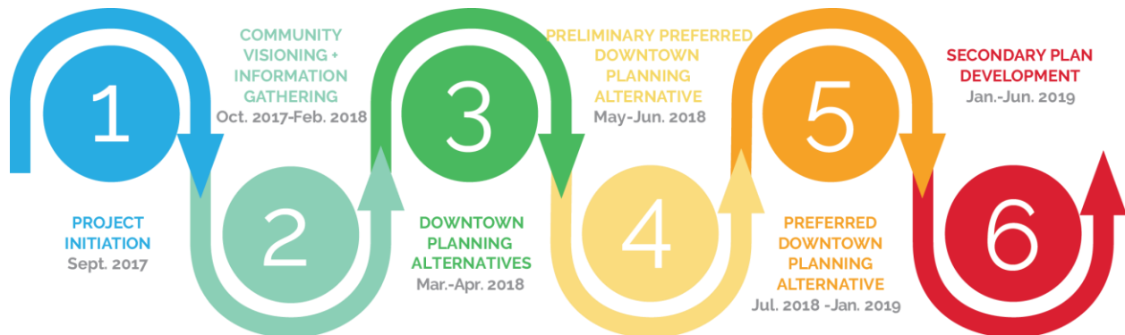
Figure 1: Six Phase Planning Process