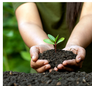
The Environment and many more

CFHN priorities for 2021 included: Youth with an emphasis on Youth and Mental Health • Domestic/Spousal Abuse • Covid-19 www.cfhn.ca