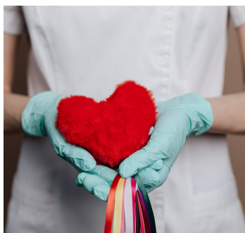
Health and Social Wellbeing