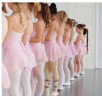
Arts & Culture