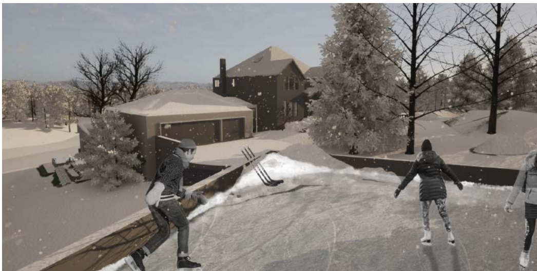
Rendering of Addition from Hockey Rink