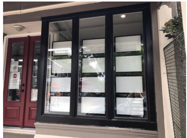
Figure 6: 519 Main Street, July 2021