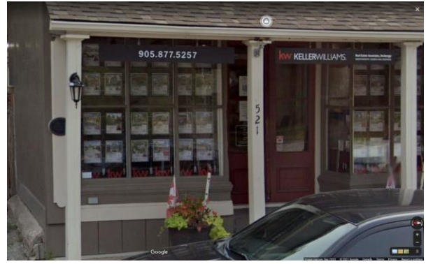
Figure 2: 519 Main Street, Pre-Alterations