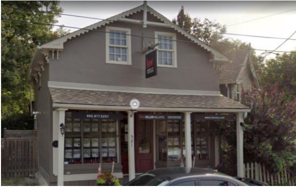
Figure 1: 519 Main Street, Pre-Alterations