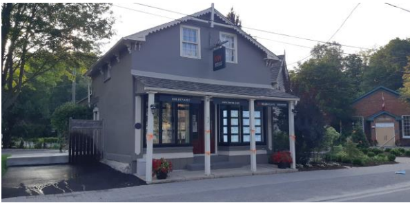
Figure 3: 519 Main Street, July 2021