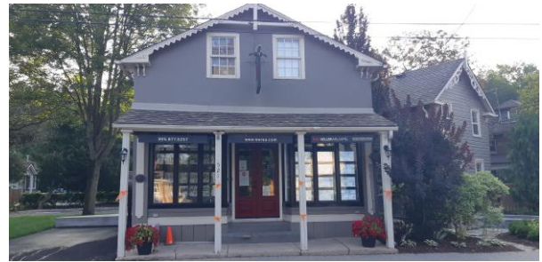
Figure 4: 519 Main Street, July 2021