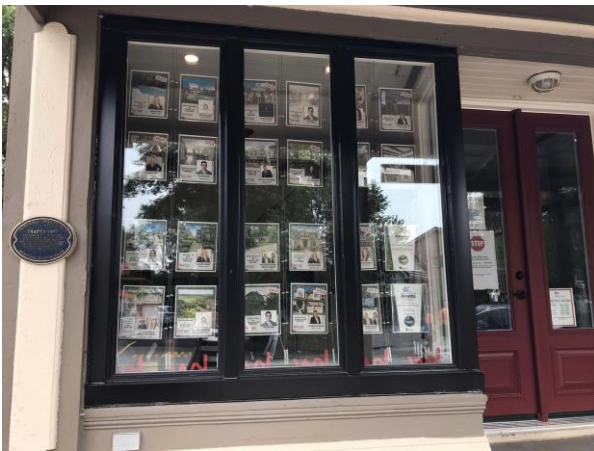
Figure 5: 519 Main Street, July 2021